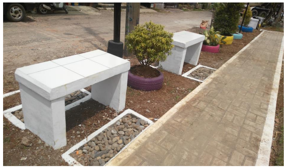
Fg. 3 Banks with water catchment – example of technology transfer

At the same time the utilization and management planning of the park was conducted by anthropologists, community representatives and teams from Indonesian Red Cross. The almost final technical drawings and estimation cost were presented to the community representatives, key stakeholders and community leaders to produce the final designs. This design had to be implemented and completed within 30 days. Apart from the design nature-based infrastructures such as water catchment area and biopori were applied (Fig. 3). The community was also taught how to make it and the reason why we should have it. This community engagement program was devided into 3 assistance phases (Table 1,2 and 3).