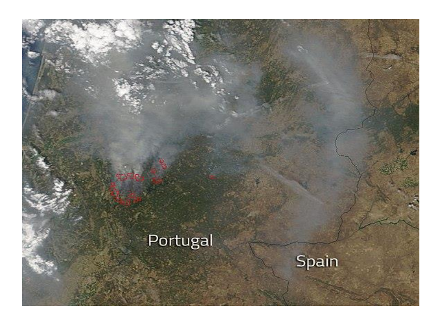
Figure 3. MODIS/NASA satellite image of the fires in Castanheira de Pera and Pedrógão Grande and associated smoke plumes expanded to Northern Portugal and Spain on June 18<sup>th</sup>, 2017.

On June 17<sup>th</sup>, 2017 the largest human loss due to wildfires in Portugal was recorded, when a series of four fire sources initiated at the central areas of the country. The incident burnt an area of 449.69 km<sup>2</sup>, caused the death of at least 66 people, as well as the injury of over 200 more, including 13 firefighters. The fires, 156 in total, spread rapidly due to the dry weather conditions and high temperatures. Most of the fatalities (47 confirmed deaths) that were evacuees occurred in the municipality of Pedrógão Grande. According to the witnesses, most of the victims died in or near their cars when the fire expanded towards the roadway they were driving in order to escape from the flames. In total, 1700 Portuguese firefighters were engaged to suppress the fire, whereas, more firefighters and equipment from Spain, France, Italy and Morocco were sent to contribute into the operations. The fire was suppressed completely on June 24<sup>th</sup>, 2017. Besides the forest areas, the fire affected also communities and public infrastructures (Minder, 2017; Portugal fire: Firefighters battle deadly blaze as temperatures soar, 2017; Portugal remembers 66 victims from deadly year for wildfires, 2018). Figure 3, shows a MODIS/NASA satellite image of the fires in Castanheira de Pera and Pedrógão Grande on June 18th, 2017, as well as the smoke plumes while they were expanded to Northern Portugal and Spain.