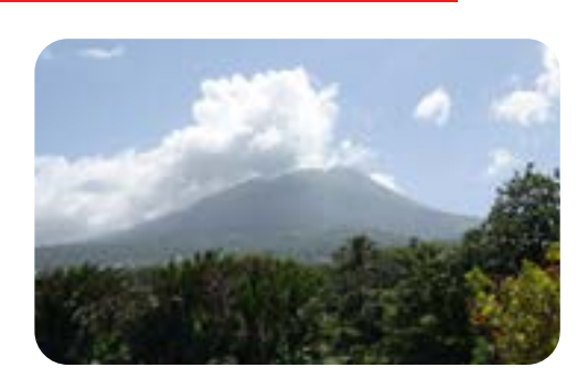
Ternate is a small island vulnerable to volcanic eruption.

the Rockefeller <u>100 Resilient Cities initiative</u>. Ternate is a small city located on a small island in North Maluku in eastern Indonesia where the project was a very new concept.