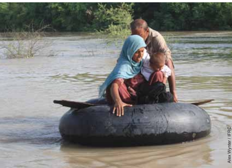
Alex Wynter / IFRC

On average, the number of people affected by disasters has remained steady, but the economic impacts of these events have continued to rise. This is in part due to the increasing number of extreme weather events that have been experienced in the region in recent decades 2 . This upward trend in climate-related disasters is very likely to continue due to the impacts of climate change (see Box 1 below for a list of current climate related trends). The impact of these more frequent disasters threatens to diminish hard-earned progress of the Millennium Development Goals, which were achieved, in part, through successful disaster risk reduction.