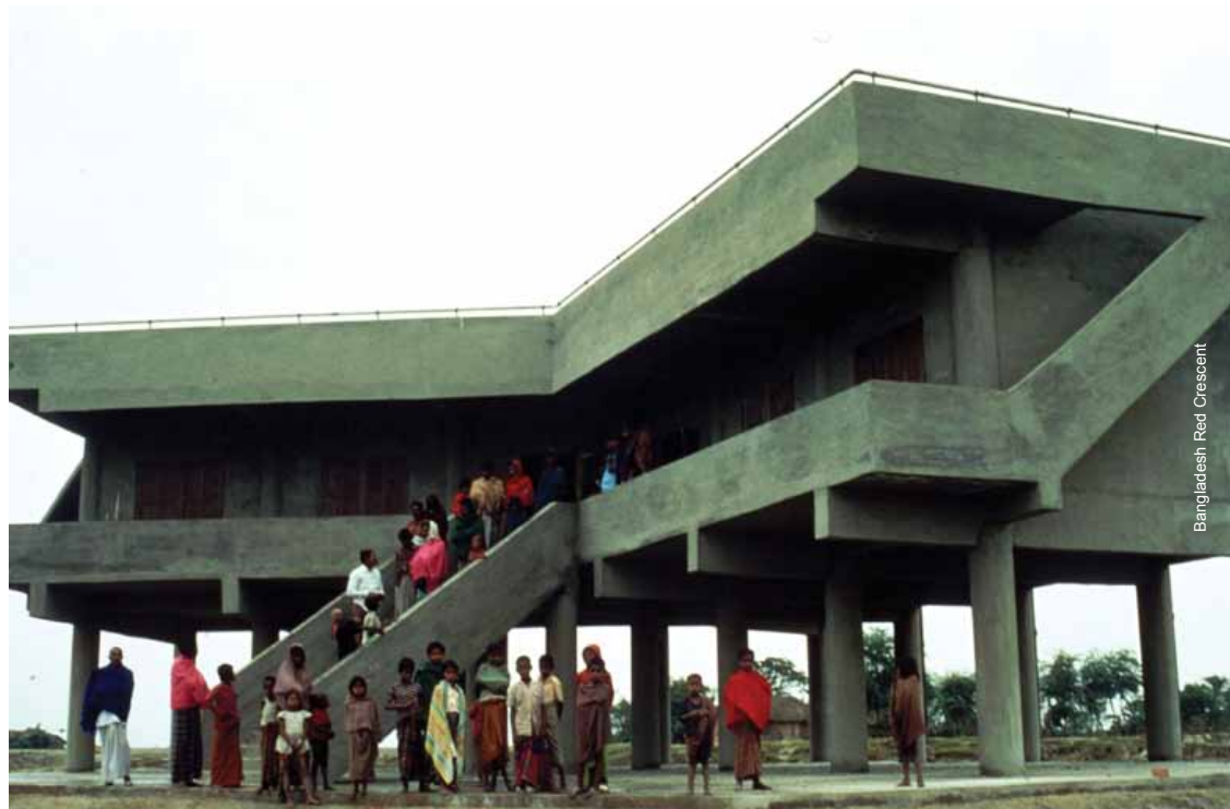
A cyclone shelter in Bangladesh which has helped save thousands of lives

High level technical information needs to be coupled with community-based application where climate information should be developed with the core aim of reaching the most vulnerable and making a difference. Of course, even with ideal climate information there is still much that needs to be done to make a difference on the ground, including triggers for action. Involving organizations that can take information to the final mile is essential if we are to stay ahead of increasing climate risk.