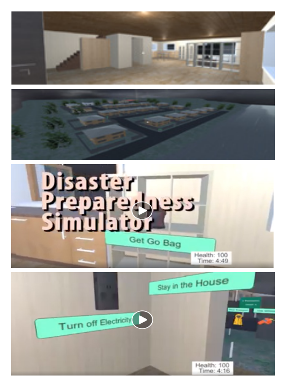
Typhoon Scenario Environment Prototype, Screenshot

1 Communicating with Disaster Affected Communities