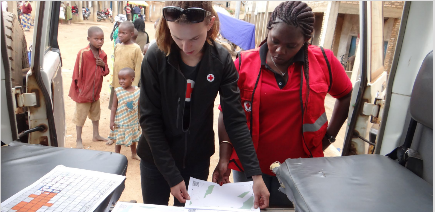
Red Cross staff and local volunteers carry out community-based mapping in Cyahinda, Rwanda. New collaborative approaches in mapping, such as crowd-sourced maps, are improving the Red Cross' ability to respond to disasters and target preparedness activities.

As we enter the next generation of humanitarian solutions, we have the opportunity and responsibility to harness emerging tools and practices that people can use and adapt to strengthen their own resilience to crisis shocks. The Red Cross and Red Crescent has developed its own criteria to ensure innovations effectively improve and expand a community's ability to prepare for emergencies, help people respond to increasing risks, and assist their recovery.