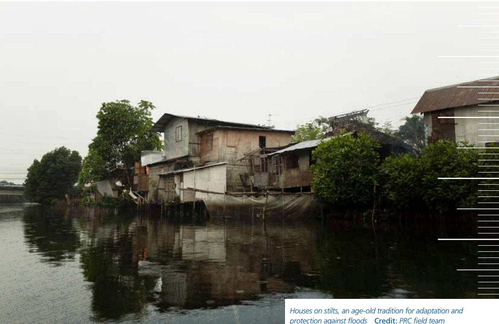
Houses on stilts, an age-old tradition for adaptation and protection against floods