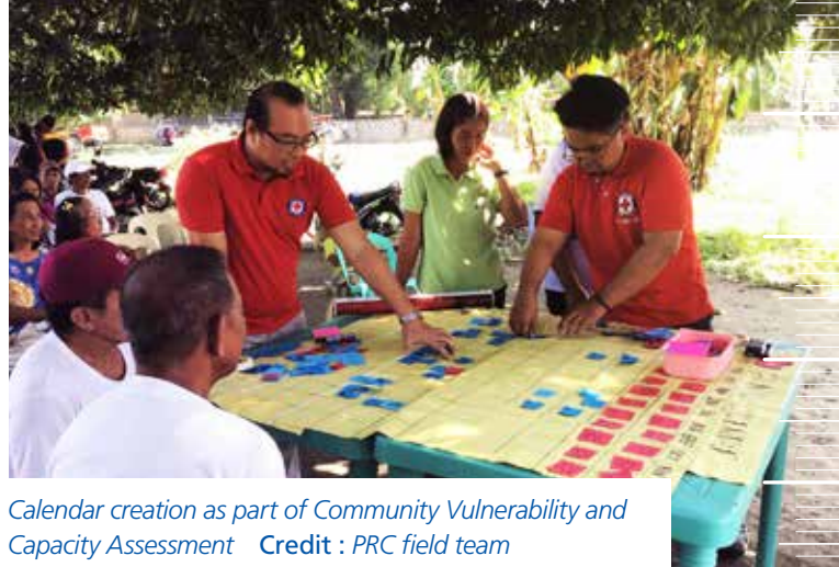
Calendar creation as part of Community Vulnerability and Capacity Assessment

Poverty incidence data show that 11 per cent of families are poor and more than 124,000 families are part of the Pantawid Pamilyang Pilipino Program (4Ps) – a government support scheme for the most vulnerable families. The Agno River cuts across the province of Pangasinan, coming from the mountain areas of the Cordillera in the north and discharging into the Lingayen Gulf. Severe flooding in 2018 resulted in USD 6.2 million in losses, impacting infrastructure, agriculture, and public works.