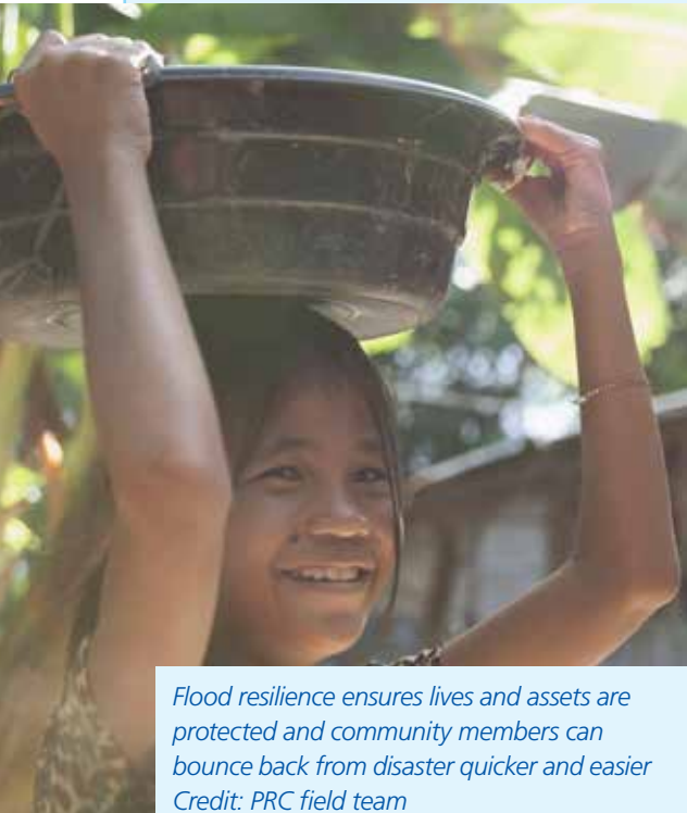
Flood resilience ensures lives and assets are protected and community members can bounce back from disaster quicker and easier

The Flood Resilience Measurement for Communities (FRMC) framework comprises two parts: (1) the Alliance's framework for measuring community flood resilience; and (2) an associated tool for implementing the framework in practice.