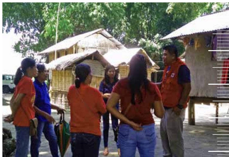
Group of women sharing their insights with Red Cross volunteer