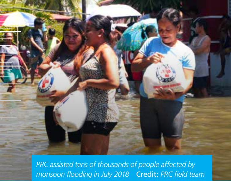
PRC assisted tens of thousands of people affected by monsoon flooding in July 2018