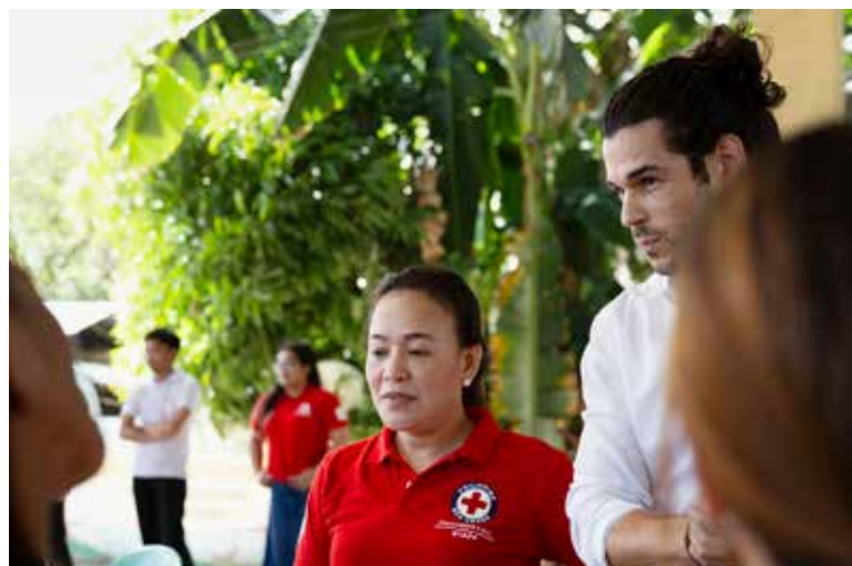
PRC, with support from IFRC and ZFRA, is working with communities in Mangatarem to address flood-related issues that affect the lives of the residents

The International Federation of Red Cross and Red Crescent Societies (IFRC) and the PRC have enjoyed a strong partnership over the years, particularly on DRRM programmes. Together with the PRC, IFRC is working with provincial and local leaders, and other key stakeholders to implement the community-based DRRM programme, which will further enhance PRC's capacity in working with communities in terms of DRRM and flood resilience.