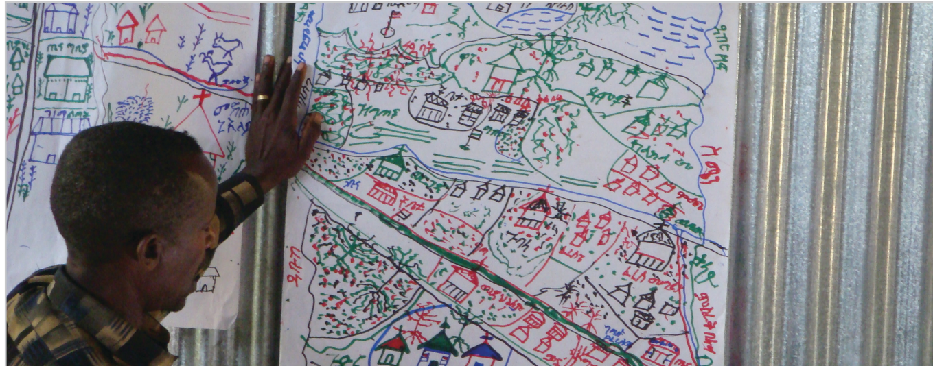
Ujala Qadir (2009)