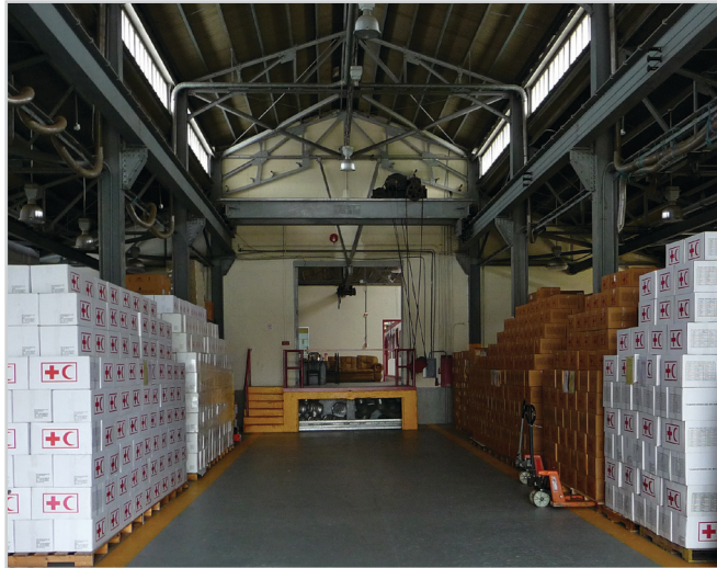
Brian Kahn (2009)

IFRC offices are used to managing the uncertainty in short-term forecasts. Longer-term forecasts, however, are more difficult to translate into action. For example, many offices at the national and community level have a hard time envisioning how a forecast for 50% chance of ‘above-normal’ rainfall over the southeastern corner of their continent over the next 3 months could serve as a warning that translates into operational decisions on the ground. With the larger uncertainty of precipitation forecasts and their rather tentative connection to actual