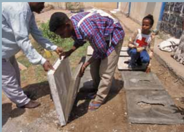
Community volunteers construct permanent squatting plates to improve household latrines and end open defecation.

In Eritrea, there are significant disparities between rural and urban access to adequate water and sanitation. For example, only 54 per cent of the rural population has access to improved water, compared with 72 per cent of urban populations. The figures for sanitation reveal even greater inequities; only three per cent of the rural population has access to sanitation compared with 34 per cent of the urban population. 1