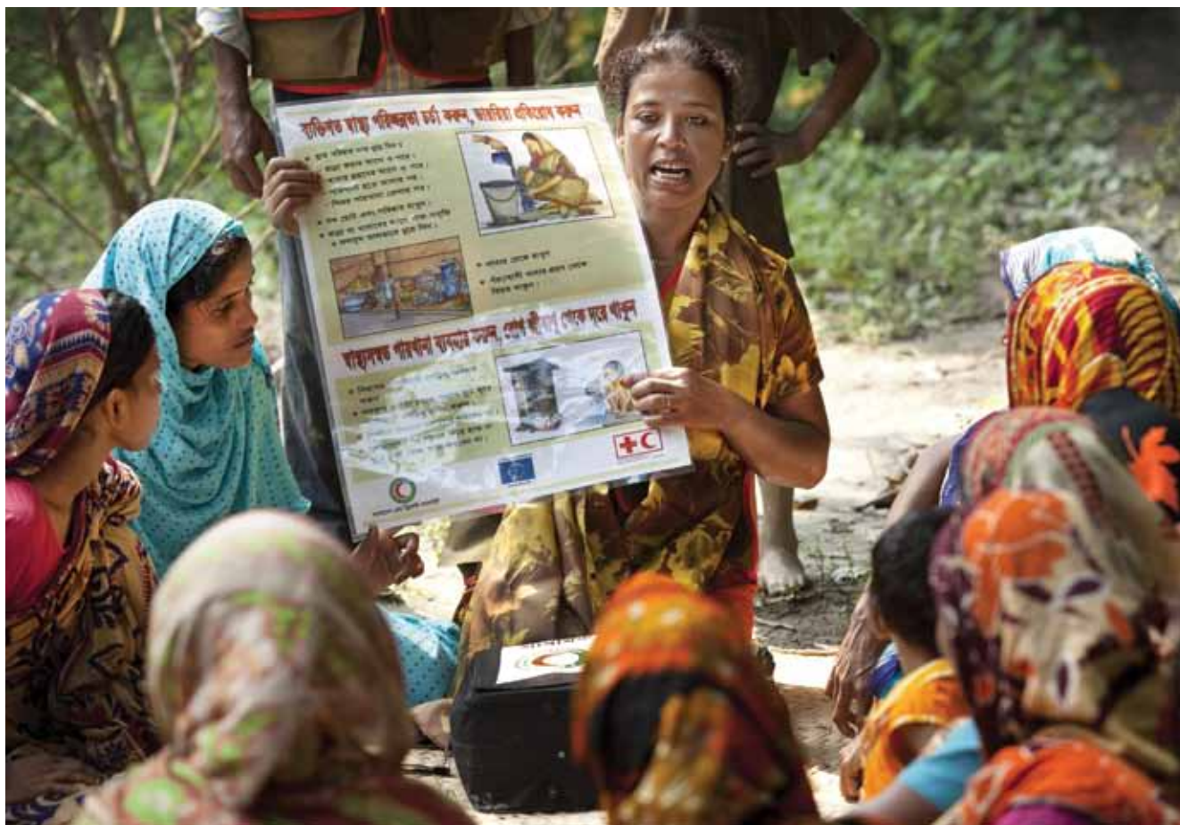
Women are the prime drivers of improvements in household hygiene behaviour and use of latrines; ensuring sanitation is sustainable.

There are many reasons for this, but the construction of a sewerage system in London during the second half of the 19th century is widely credited as one of the most important factors. Originally intended to reduce the odor of the Thames River, the