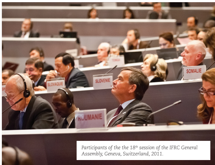
Participants of the 18 th session of the IFRC General Assembly, Geneva, Switzerland, 2011.

National Societies, the ICRC and the Federation are separate bodies. Each has its own individual status and role, and have agreed to mechanisms for ensuring that their actions are well coordinated, and fit a common policy framework where appropriate.