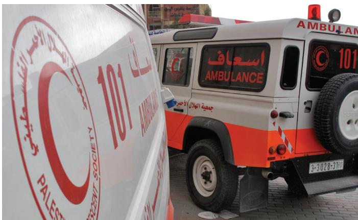
The use of the emblem for protective purposes is a visible manifestation of the protection accorded by the Geneva Conventions to medical personnel, units and transport.