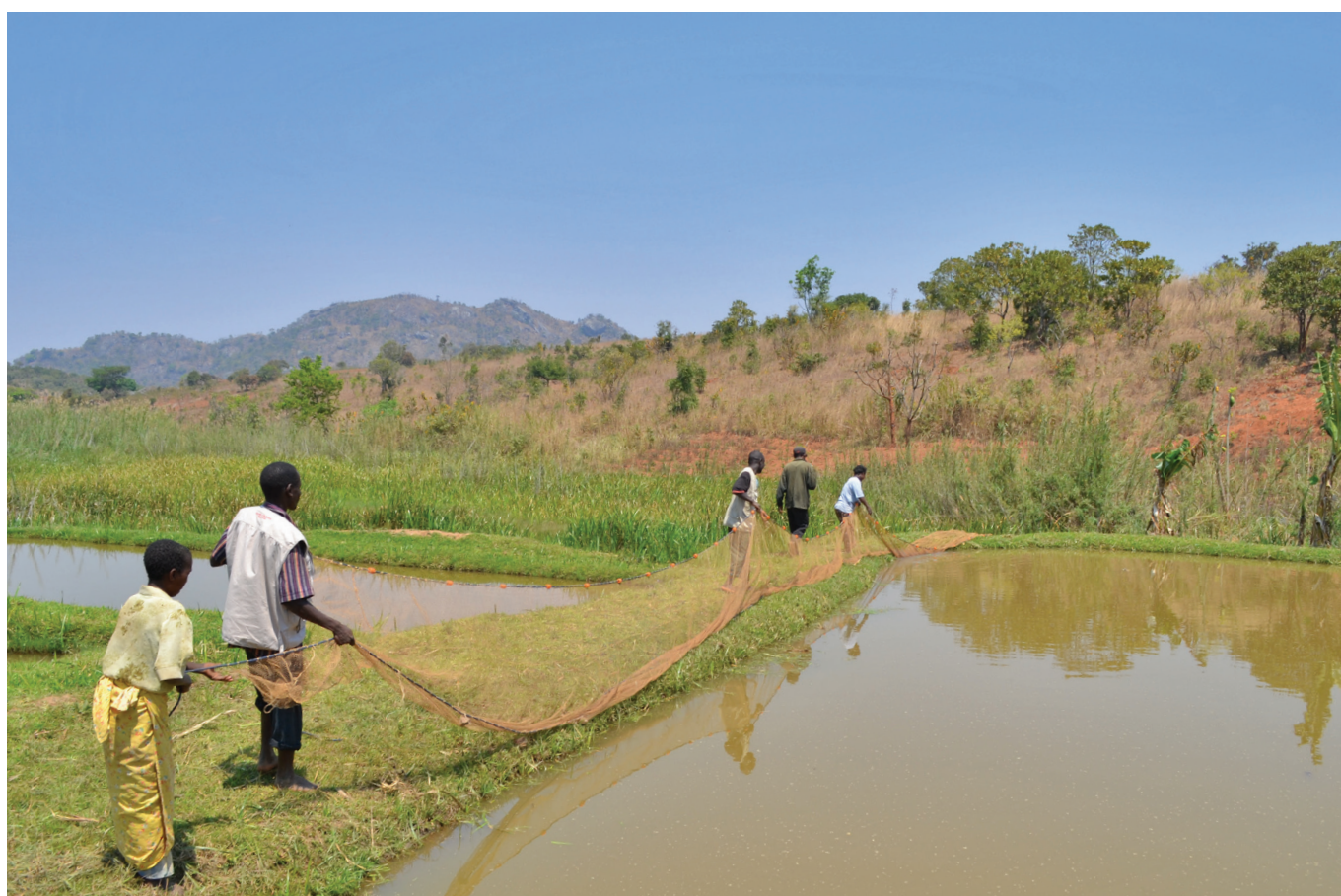
Fish ponds in Malawi. The harvested fish are shared among members and the surplus is sold to raise cash.