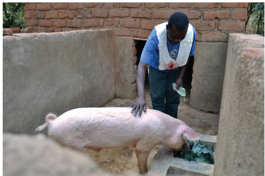
Vegetable and maize growers provide feed to the animal husbandry farmers.