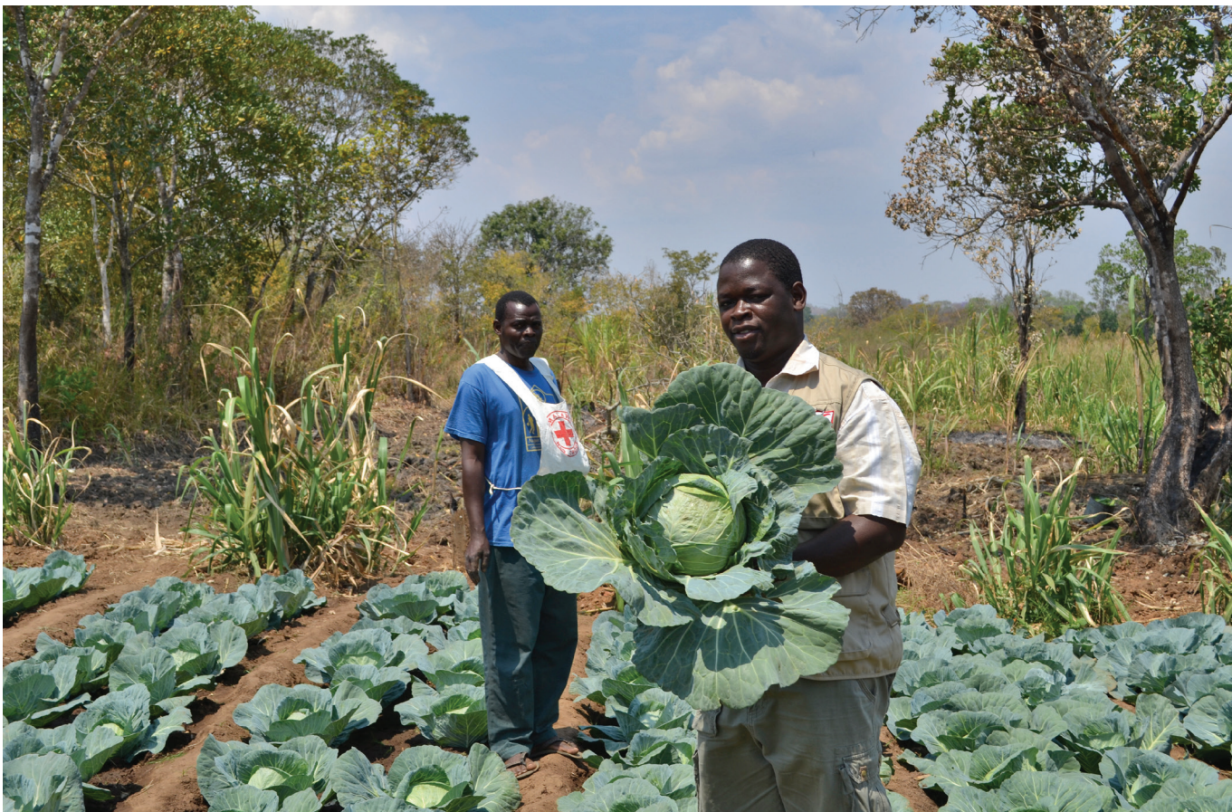
Vegetables from Red Cross gardens are used for family food or sold at local markets.

Malawi experienced very high inflation and fuel and foreign currency shortages which affected programme implementation in the last two years. Prices of farming inputs kept escalating and affected the budgets. In order to minimize disruption, the Malawi Red Cross Society, where possible, procured some of the requirements in abundance from local markets near the projects to cut on fuel costs. These challenges also caused delays in the disbursement of funds, and some activities were postponed. The success of the project has attracted more people, particularly those affected by droughts.