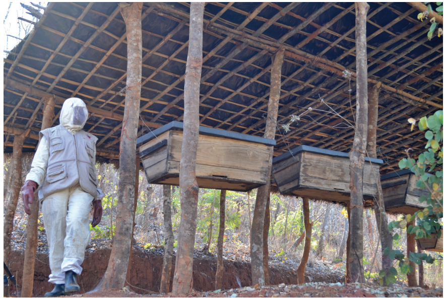
The bee project is a source of income for Malawi Red Cross Society farmers.

This programme was made possible through the financial and technical support of the