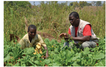
Malawi Red Cross Society staff provides technical support to farmers.