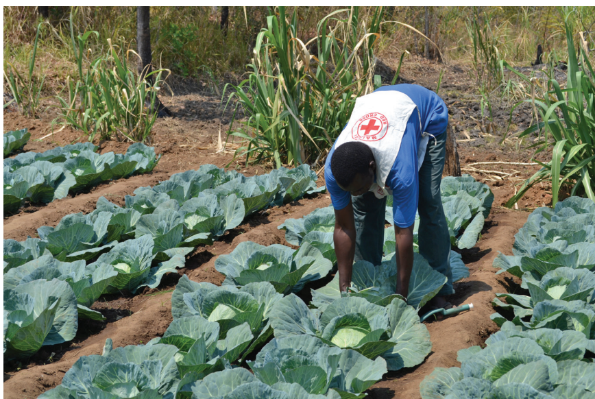
Increasing food availability and access in Malawi.

farmers can economically trade and exchange produce. The first phase of the projects starts with the provision of a start-up agricultural input package which includes a range of items such as appropriate seeds, goats and pigs, tools, irrigation equipment, fertilisers and chemicals. This is combined with community-based education on small-scale irrigation, soil and water conservation. Following these lessons, community and family-based fishery ponds and gravity powered irrigation schemes have been built with the help of the Malawi Red Cross Society. During the second phase, communities with the facilitation of the Red Cross share knowledge on nutrition, balanced diet and ways of food preservation and processing. Linked to this, are community-based seed/grain banks and promotion of vegetable gardens and fruit tree seedlings. Through such initiatives communities learn how to preserve seeds and vegetables from their harvest for future use. The third phase is interconnected to phase one and two. Families and communities involved in animal husbandry and fishery projects depend on grain and vegetable growers to supplement their