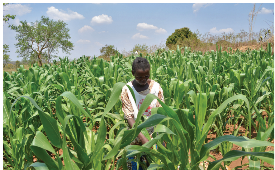
Women's involvement has been key to the success of the projects.