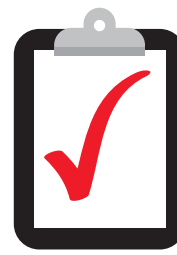
Data for decisions