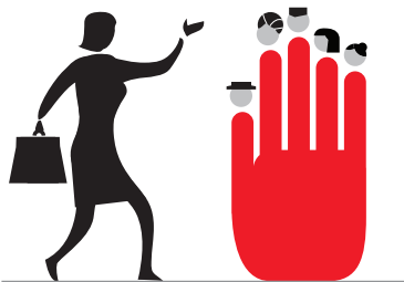
Evidence base for humanitarian diplomacy