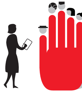
Dialogue with the community