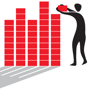
Data analysis and improved programme delivery