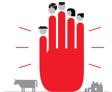
More resilient communities