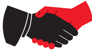
Community driven programmes and community engagement