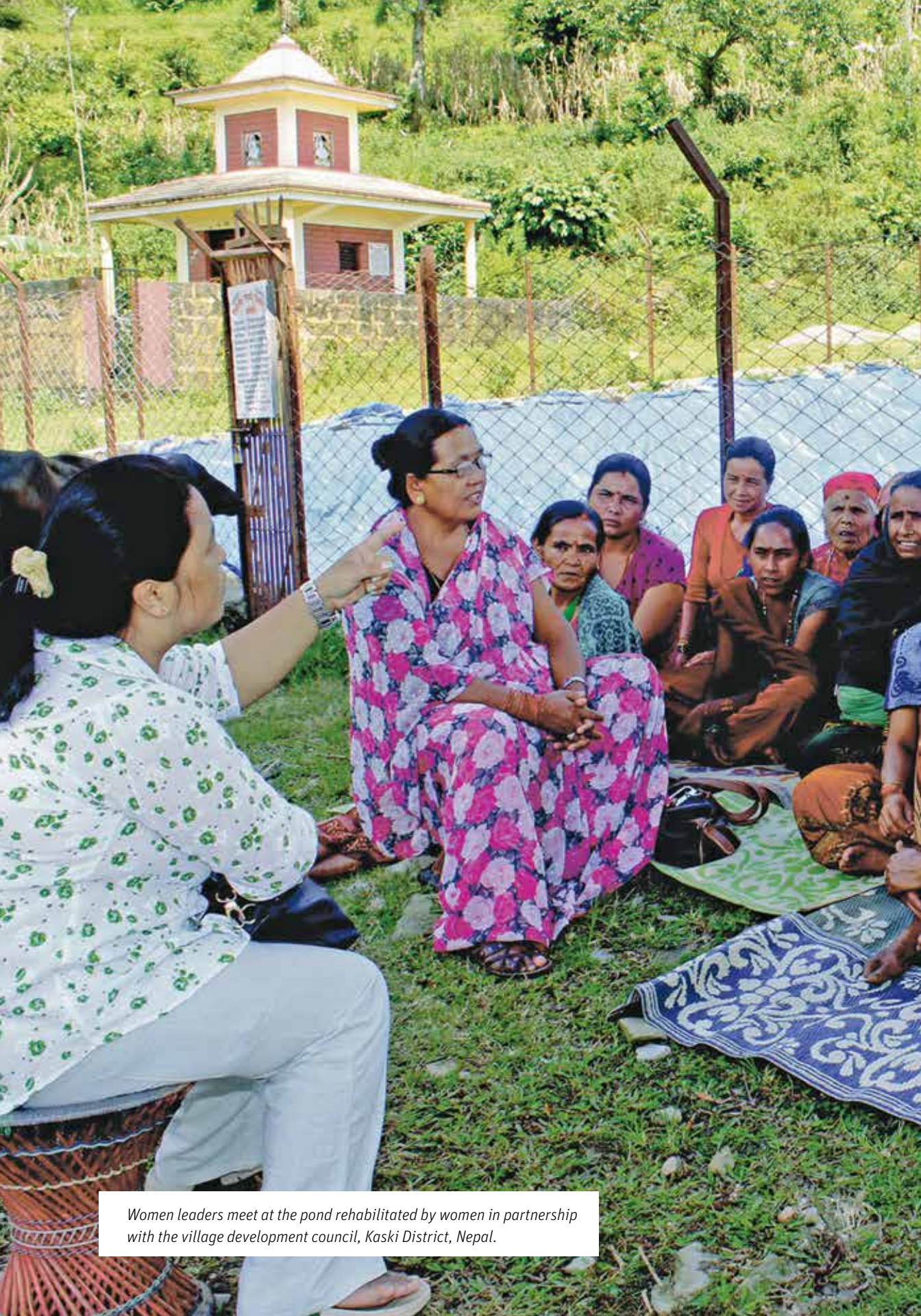
Women leaders meet at the pond rehabilitated by women in partnership with the village development council, Kaski District, Nepal.