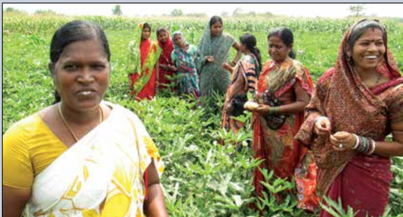
During a visit to Bihar by Maharashtra and Tamilnadu women.