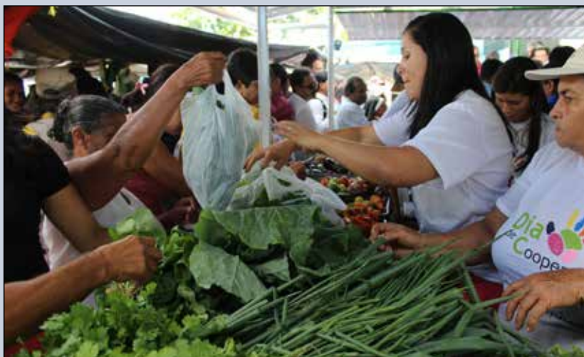
Members of cooperatives selling their produce.