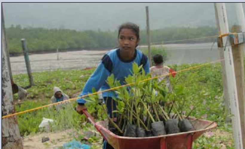
Student of Secondary School 37 Teluk Kabung Selatan and the communities took the seedlings from the seeding area.