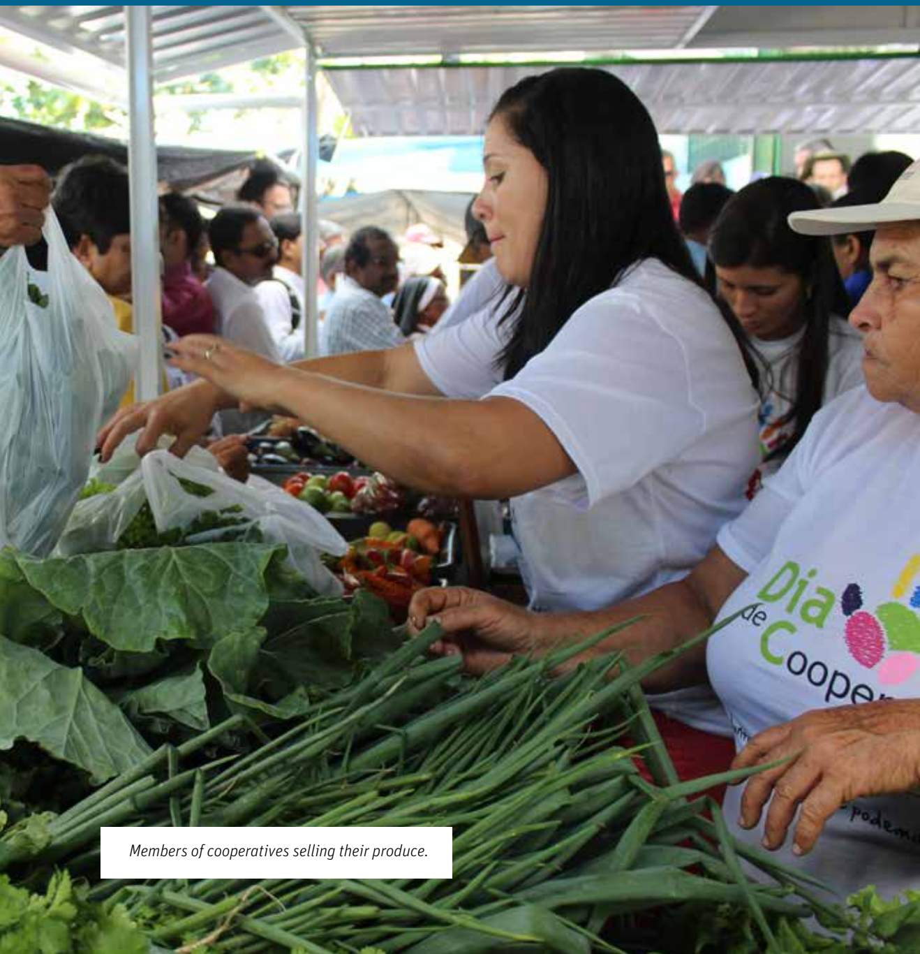
Members of cooperatives selling their produce.