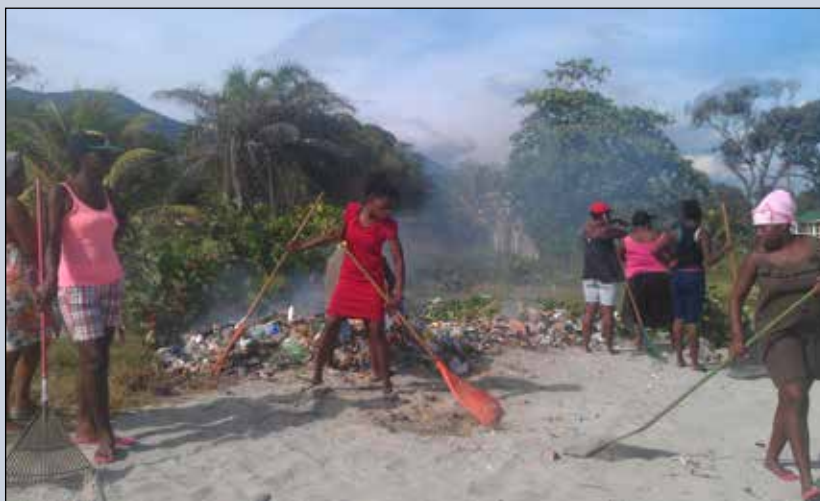
Members of WAGUCHA participate in a beach cleaning in the community of Corozol, Atlántida.