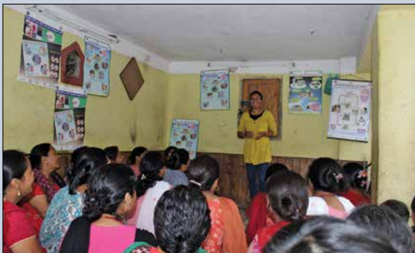
Lumanti Support Group for Shelter in Kathmandu.