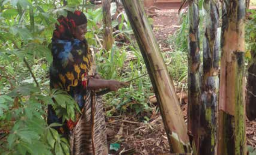
Member of SWID works on a demonstration garden.