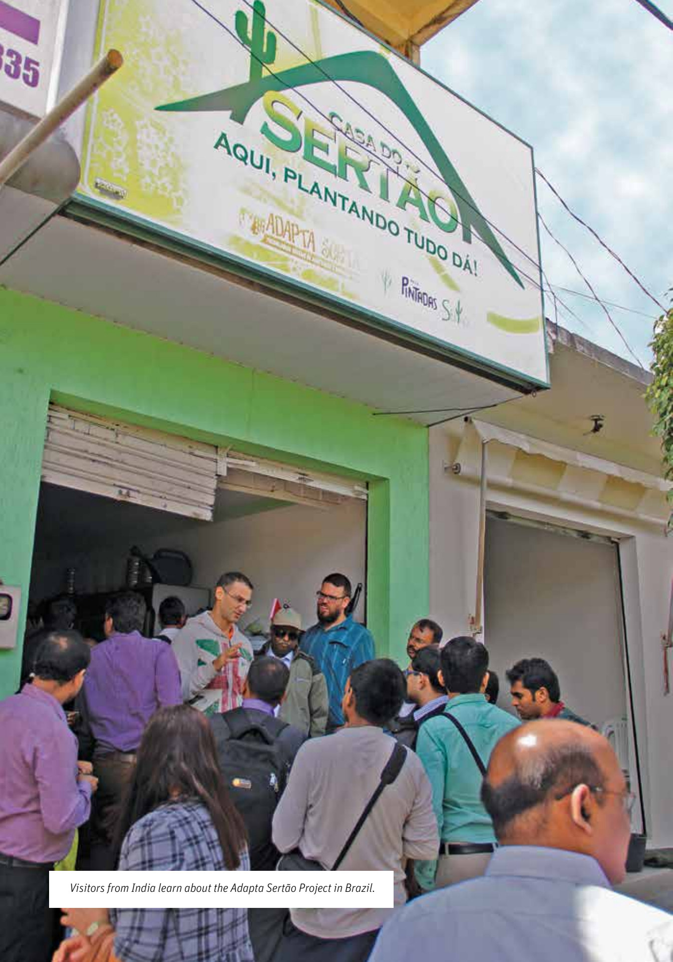
Visitors from India learn about the Adapta Sertão Project in Brazil.