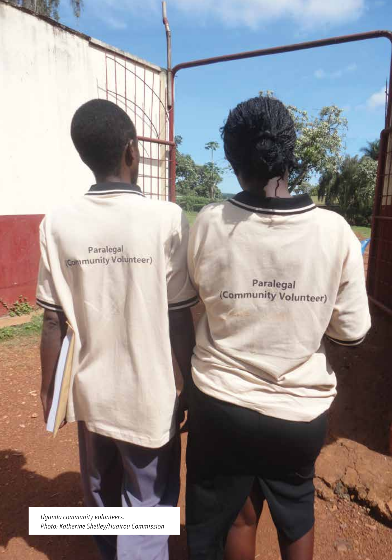
Uganda community volunteers.