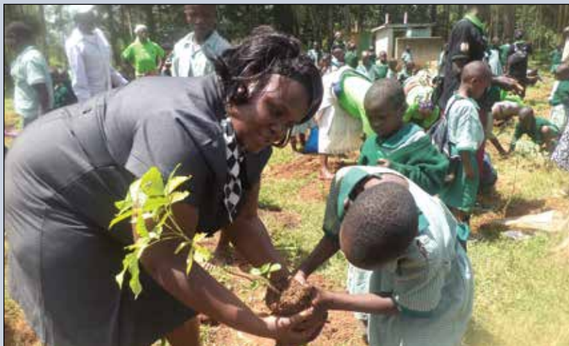
School tree planting program.