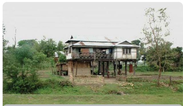
Disaster Preparedness in local house design

Connectors include the fact that most refugees are of Nepali ethnic origin and have the same culture, religion and language as the local community. They sometimes