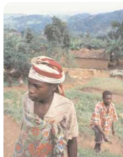
A woman collecting firewood for food preparation.

The community-based approach with extensive vulnerability and capacity assessment ensured that communities considered that they 'owned' the project and participated in its management. While the pilot project raised several issues of timing of inputs, these are being carefully addressed in the development of further programming in new areas of Rwanda, demonstrating the importance of learning from experience.