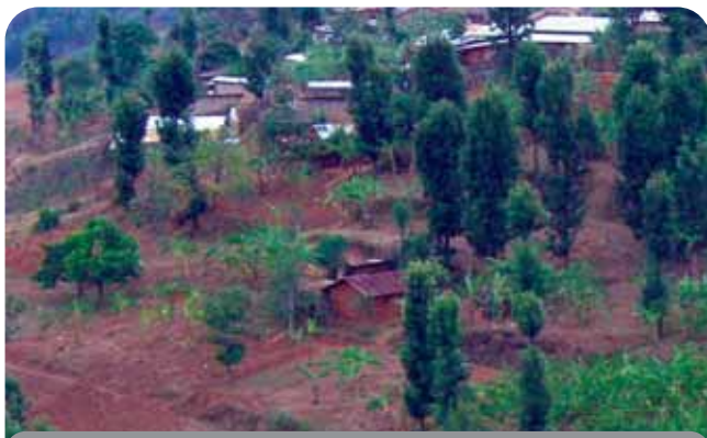
Rwanda is densely populated with limited land resources.

In terms of sustainability, this type of project obviously needs material inputs and funding, and therefore is not in itself self-sustaining. However, the process of VCA led by the Rwandan Red Cross is now being improved and replicated in other areas of the country. In this sense, it can be considered that a sustainable model has been set up which