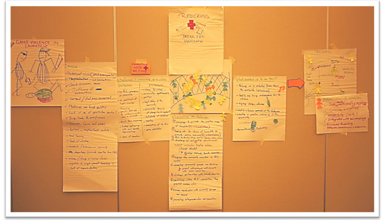
Figure 7. Results of resilience scenario on gang violence