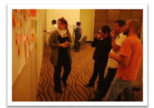
Figure 4. Analysis of migration

A multitude of causes for vulnerabilities of migrant population were identified, including: the risk of suffering (workplace/ sexual) exploitation, social invisibility, lack of knowledge of their rights (due to legislative change), limited economic power (fewer opportunities), absence of social networks of belonging, limited access to health and education.