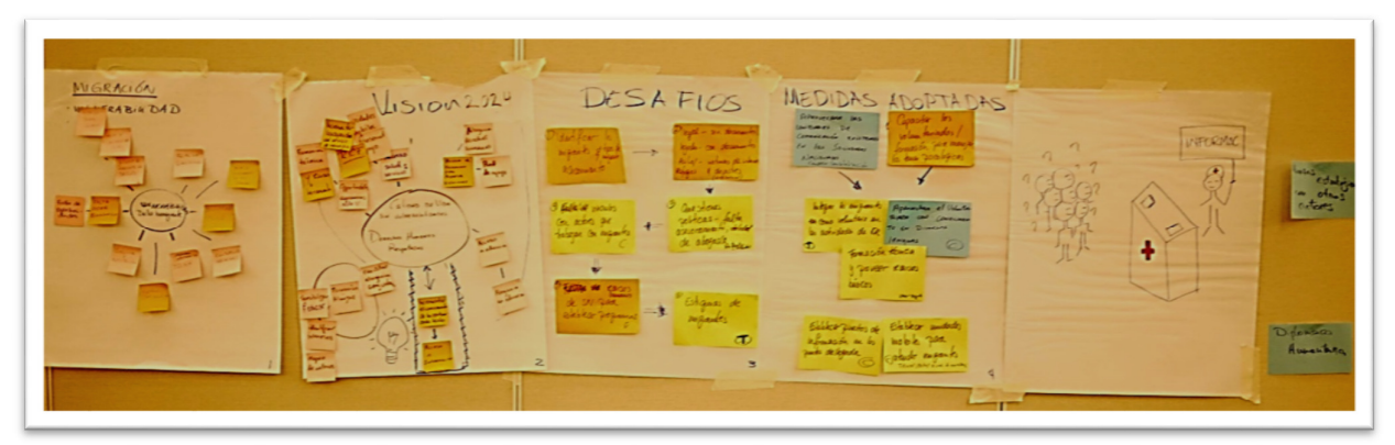
Figure 5. Results of resilience scenario on migration

social support, also including the migrants themselves in the volunteer work and encouraging "peer to peer" approaches; promoting cultural and recreational activities around the culture of migrants to sensitize population and political actors; and providing access to basic services.