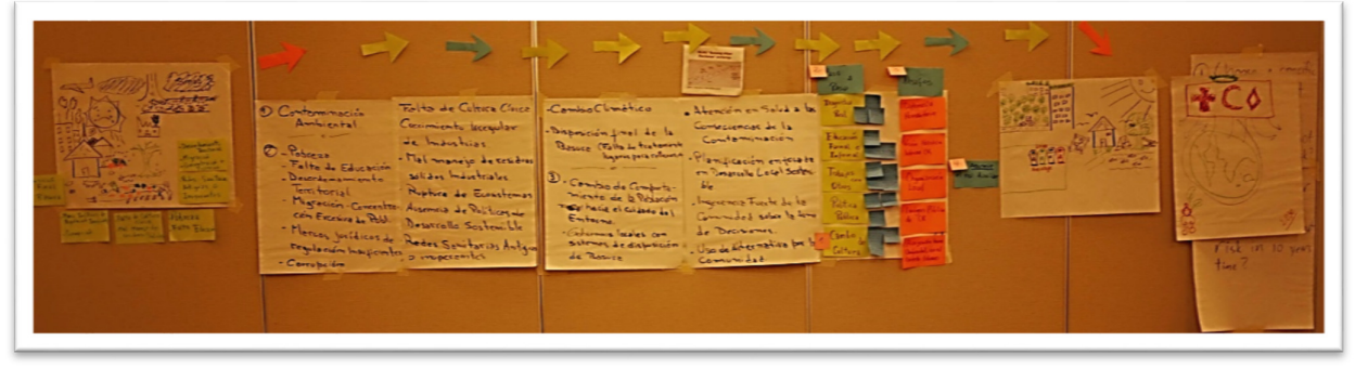
Figure 11. Results of resilience scenario on environmental pollution