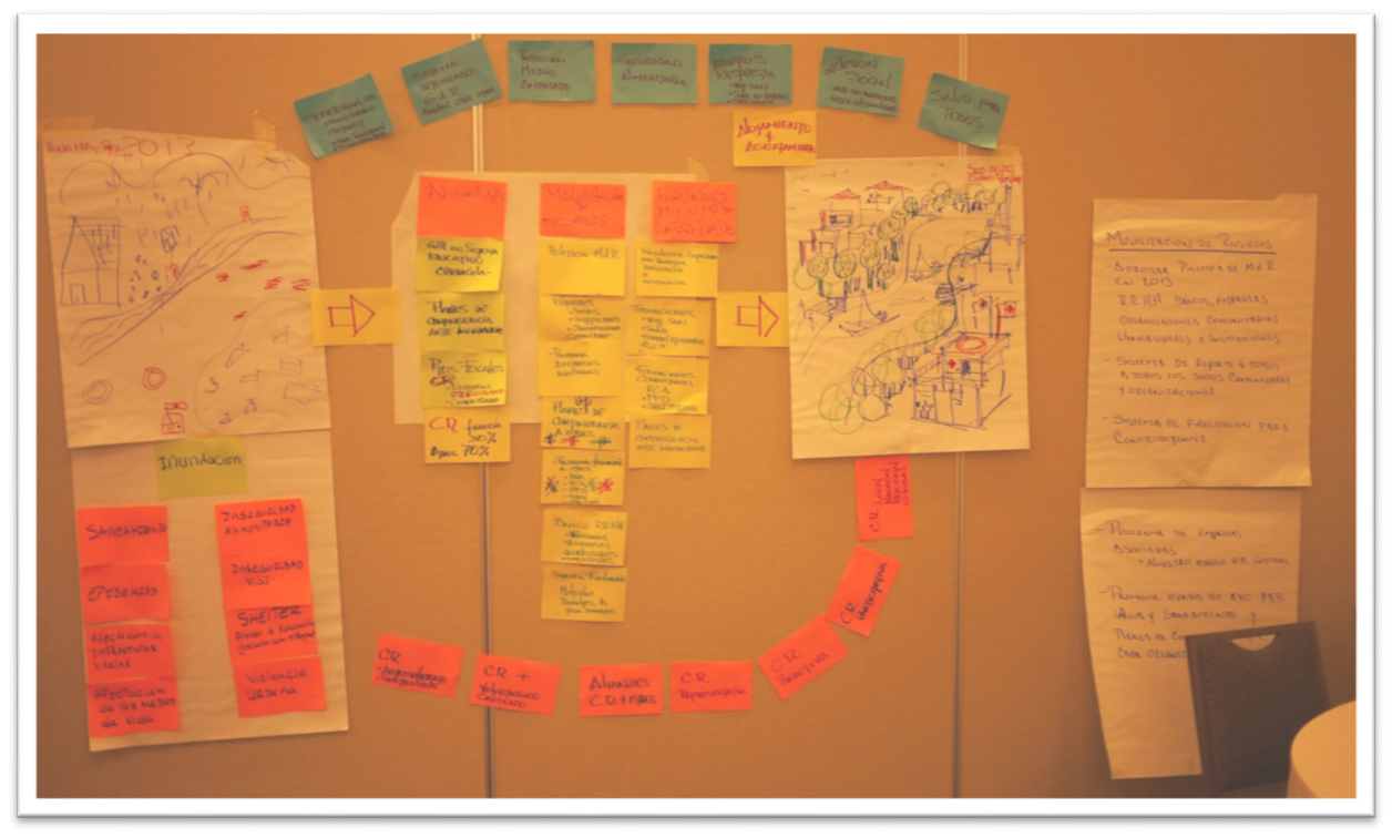
Figure 9. Results of resilience scenario on flooding