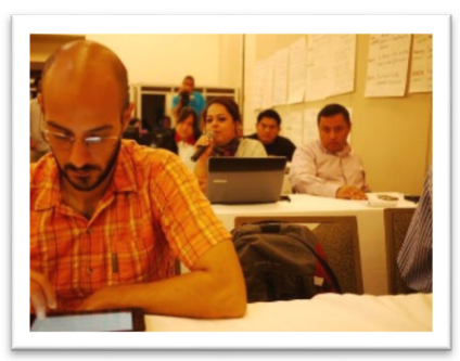
Figure 2. Presentation by the Colombian RC

Although it now appears that the country is entering a postconflict phase, the reality is that the violence is moving from the rural to the urban areas (and especially in the capital) particularly in the domestic setting<sup>5</sup>. There is also a return to the smaller cities, but the problems of the big cities (like violence, prostitution or drug addiction) are being dragged along in the process.