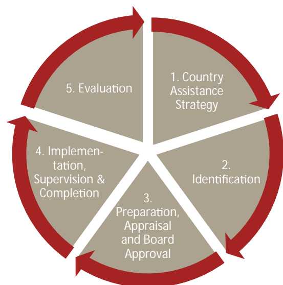
Figure 1: The World Bank Project Cycle

Figure 1 summarizes the main steps of a standard World Bank project. Table 2 identifies a series of actions that can be taken by World Bank staff, clients and development partners within existing processes of the project cycle.