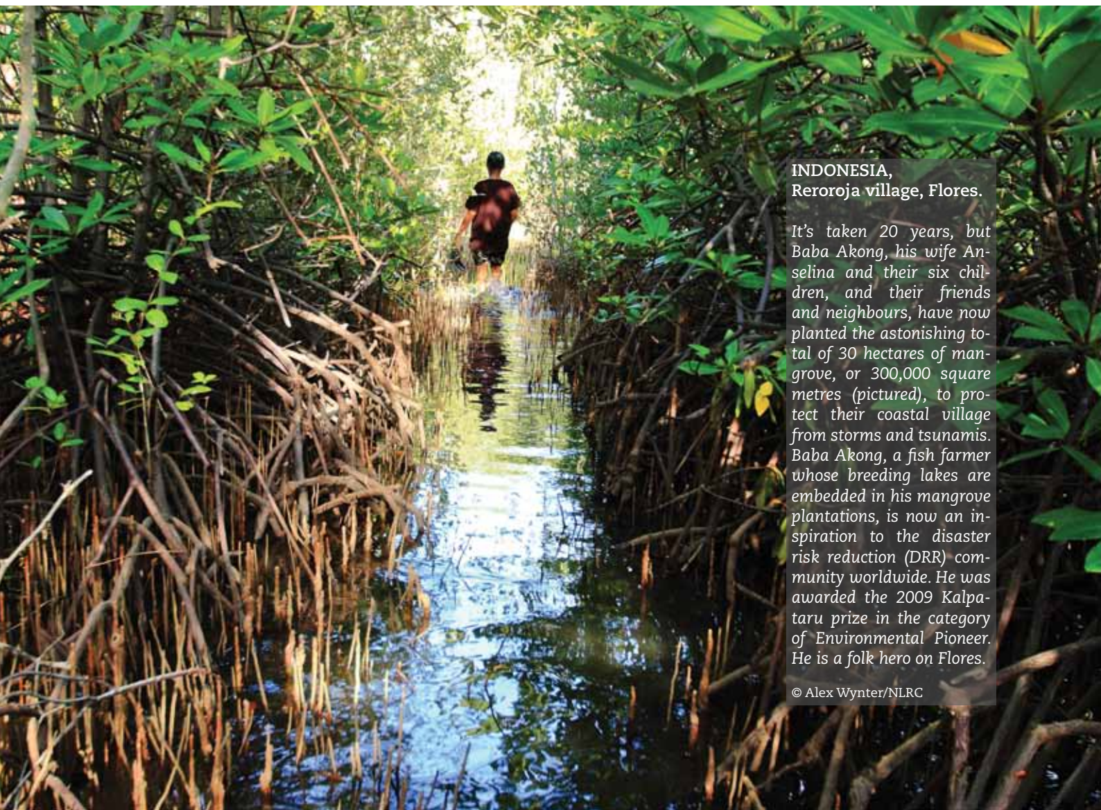
INDONESIA, Reroroja village, Flores.

The Red Cross Red Crescent is known for its humanitarian work around the world, but has for a long time been equally involved in developmental activity. In reality the distinction between these two spheres is an artificial one for the people affected by crises. We are calling for a serious shift in mindset and for all concerned to work together to bring about long-term and sustainable change in the lives of vulnerable people. This requires moving beyond placing labels on organizations and looking at what we can – concretely and to scale – contribute not only to disaster response, but to risk reduction, public health, sustainable development and the protection of human rights. We look forward to taking this journey together with our key partners and stakeholders.