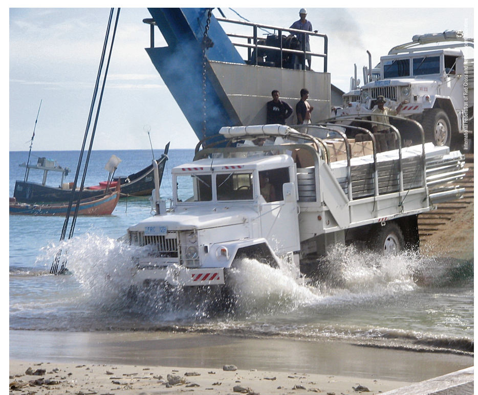
Transitional shelter program supplies arrive via sea transport during the tsunami operation in Indonesia

In November 2007, states and Red Cross and Red Crescent actors unanimously adopted the Guidelines at the 30th International Conference of the Red Cross and Red Crescent.