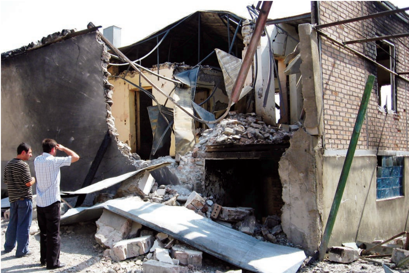
The IRC surveys homes destroyed by recent bombings in Ruisi, one of the villages surrounding the town of Gori, in Georgia.

This can be done outside of any given crisis so that we are better able to work together when a crisis hits. A good example is the Emergency Mapping and Analysis (EMMA) toolkit 17 which helps to structure analyses of markets, gaps in provision and possible interventions.