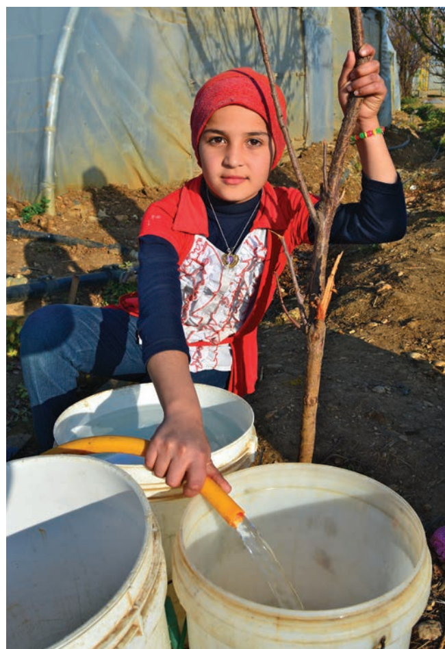
A Syrian refugee girl fills water containers near her family's tent in north Lebanon.

Humanitarian actors should invest in efforts to transform the policy environment, to one that enables urban populations, including the displaced, to earn a living and become self-sufficient. 15 This is urgently the case in situations of urban displacement, where the displaced are often seen only as a burden. There is a need to shift the perception to enable urban displacement to be seen as a development opportunity. 16 The role of the private sector (local, small and medium enterprises) is again critical in this regard. Humanitarian and development actors have a vital role in harnessing economic and employment opportunities for those displaced by conflict, working towards a 'win-win' situation for affected populations and government alike.