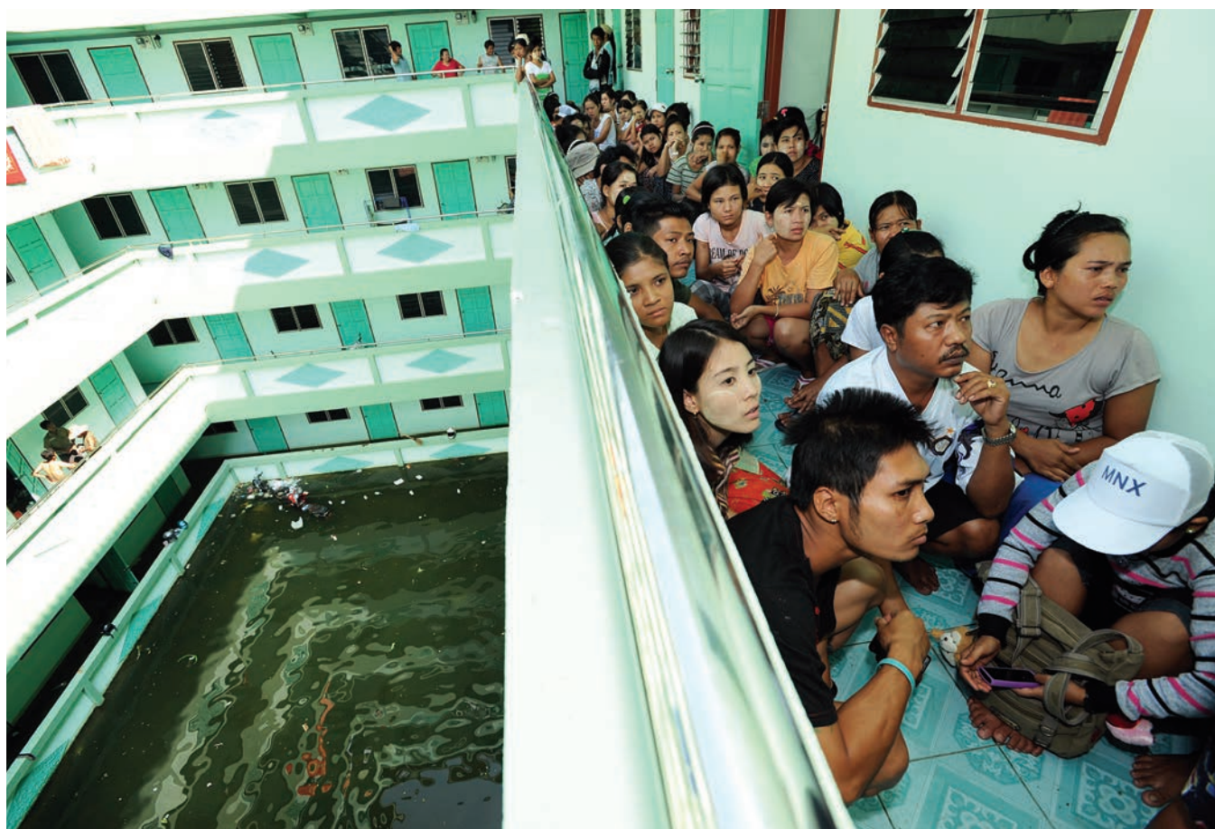
Burmese residents in Wat Kan Ham, Thailand. The building is surrounded with dirty water.

Operational preparedness can only be effective if based on an understanding of the complexity of towns and cities: spatial, social, political, cultural, environmental, and economic. Learning about and understanding the urban space should be an ongoing activity for the humanitarian community: undertaken before crisis hits or as soon as possible thereafter through rapid assessments, analysis and mapping, and repeatedly throughout a crisis. Further, humanitarian actors should understand land tenure systems, particularly customary systems and the land rights of the urban displaced. It is particularly critical to understand the urban space, given that it is characterised by interdependencies,