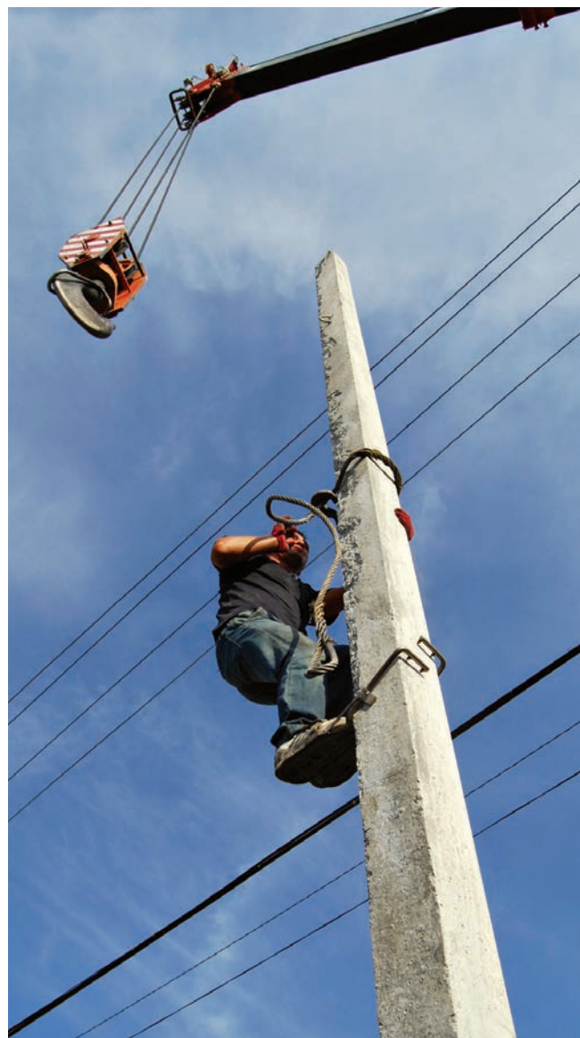
Here in a neighbourhood in Osh, Kyrgyzstan, the IRC is providing more than a dozen new power poles. Made of steel and concrete, the posts should last decades.

To be innovative and truly transformative, urban humanitarian programming should seek to build on existing capacities of towns and cities and their inhabitants. Efforts to create transformation through innovation should engage affected communities, including civil society and private sector. Humanitarian actors should ensure local populations are involved not only in implementing programmes but in monitoring their performance. Affected governments