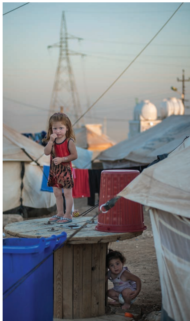
Two young refugees from Syria at the Arbat camp, Iraq

Fourth, to reduce vulnerability and manage risk in urban areas requires the international community to be better prepared for urban crisis, with an improved understanding of the city and its inhabitants through modified analysis, mapping appropriate for the urban setting and partnering with non-traditional actors. This means: