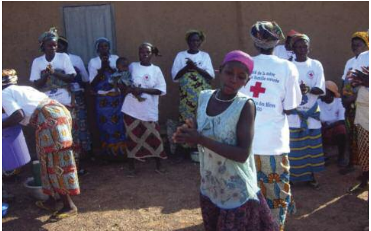
<sup>1</sup> http://www.fco.gov.uk/country profile Togo

The first mother's club was founded in Bassar, Kara (centre-west of Togo), in connection with activities to promote the reintegration of Ghanaian refugees that were carried out in 1996 in Bassar Prefecture. Mothers' clubs