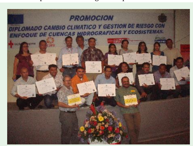
Graduation of the diploma course on "Climate Change and Risk Management with a Focus on River Watersheds and Ecosystems."

One of these courses, on "Climate Change and Risk Management with a Focus on River Watersheds and Ecosystems" was given by the National Autonomous University of Nicaragua (UNAN Managua-FAREM Estelí) and technical personnel from CARE. The 28 people trained in this course work in institutions, municipal governments, and nongovernmental and community organizations in the municipalities of San Lucas, Totogalpa, Ciudad Antigua, Yalagüina, Palacagüina, San Fernando and Somoto.