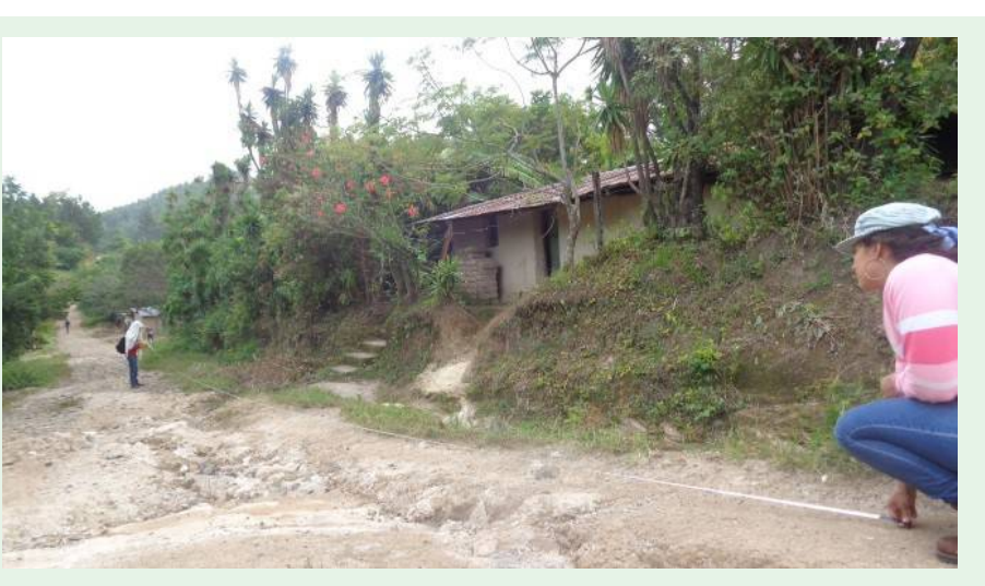
UCA students gathering information in San José de Cusmapa for the urban area development plan.

"The population has also become aware of the need for environmental protection," the mayor explained. "We achieved this thanks to the Red Cross and the universities, as they are supporting the development of municipal management."