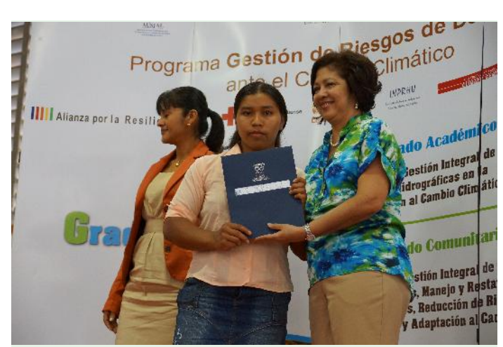
Graduation ceremony for the diploma courses held at the UCA, December 2013, Somoto.

The three diploma courses the Program promoted allowed the technical capacity-building of 89 key actors from the Inalí and Tapacalí sub-watersheds. This has had a multiplying effect because those who completed the courses subsequently promoted what they learned in their institution or organization. The participants also established relationships that could be useful in their professional work and in the coordination of activities between the upper/middle and lower parts of the sub-watersheds where they work.