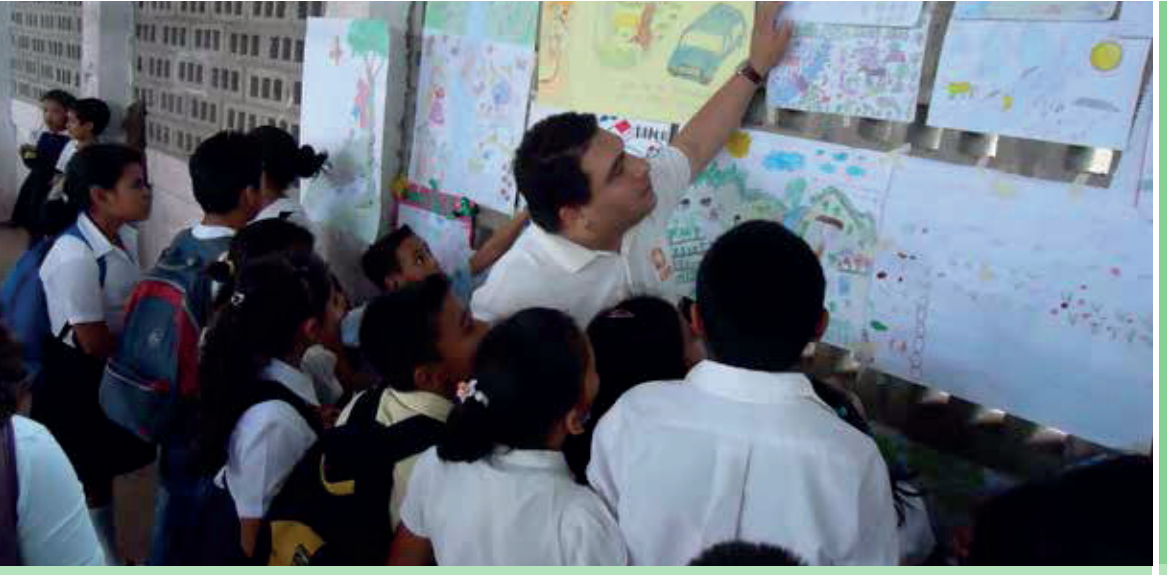
Sensitization campaign: exhibition of drawings by children from different schools of San Lucas (Madriz) for the drawing competition "This is how I want the environment of my community to look like".