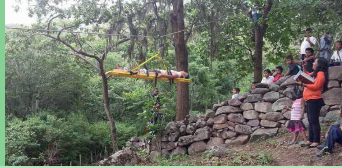
Children evacuation drill, simulation of landslide due to heavy rains, school of the rural community of El Chichicaste, San Lucas, Madriz.