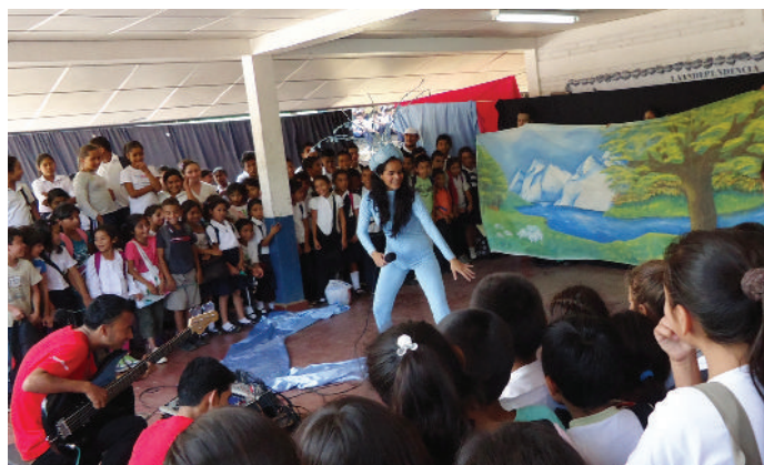
A play presented at rural schools in the municipality of San Lucas.

In the municipality of San Lucas, for example, over 1,200 children, teachers and parents were sensitized. With support from the Ministry of Education (MINED), small school forums were promoted in preparation for the municipal environment forums organized in 2013 and 2014. The children and parents promised to ensure reforestation, the recycling of solid waste and river watershed management in the schools.