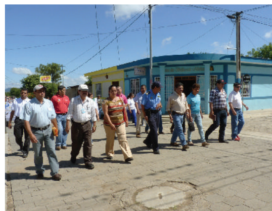
Authorities, institutions, civil society organizations, local disaster prevention committees, and school brigades marching in the city of Somoto in celebration of International Day for Disaster Reduction, October 2012.

The Program's Visibility Strategy formed the basis for this awareness-raising and education campaign, defining the groups that needed to be worked with according to their particular characteristics and interests. The following groups were included: local authorities, community leaders, religious leaders, teachers, donors active in the sector, non-governmental organizations, indigenous populations and opinion formers.