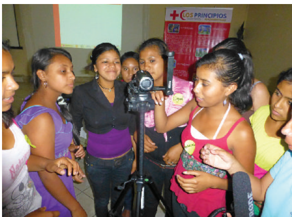
Participatory video workshop with networks of young people from Las Sabanas and San José de Cusmapa.

Starting in 2013 with support from the organization Pool de Trainers 12 , participatory video was promoted as a social strengthening tool to improve basic skills for documenting changes in attitudes and practices and for promoting culture and decision-making. The messages produced, filmed and edited by young people were shown to the community, decision-makers and donors. The process started with learning to use the video equipment and an editing program. Pool de Trainers also produced a documentary on the Tapacalí River sub-watershed, providing a tool with which to continue sensitizing the population on the area they live in.