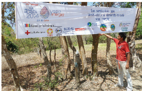
The celebration of World Water Day involved the organization of micro-watershed clean-up campaigns in 2014.

“Today we are starting to clean up the Quebrada Sucia micro-watershed. This work we are doing in alliance and complementarity with PFR has been strengthening all of the social aspects we’re promoting. This clean-up campaign is designed to make us alert to prevent all risks of flooding due to the accumulation of garbage in the brook. We have to really emphasize the areas of greater risk, such as the border communities, and void the propagation of dengue, eliminating pools of water and garbage throughout the municipality. With everyone’s participation we can eradicate the centers of infection to avoid illnesses.” The mayor of San Lucas, Deysi Pérez Vázquez, at the launch of the 2014 awareness-raising campaign under the slogan “Clean micro-watersheds give us clean water.”