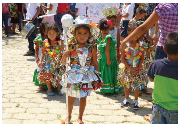
Fancy-dress competition involving costumes made of recycled materials worn by preschool girls from San José de Cusmapa during the food fair held in April 2013.

Women's participation was also fundamental in the holding of workshops on natural medicine and alternative foods that were organized in the framework of the Harmonization of Indigenous and Local Knowledge. 9 This in turn allowed the design and staging of a food fair under the slogan "Human health is a reflection of the Earth's health." 10 The fair was held in April 2013 in San José de Cusmapa, its main objective being to promote the recovery of native seeds and locally-produced alternative foods and their inclusion in the family diet. The fair also raised the population's awareness of reusing solid waste by transforming it into useful products.