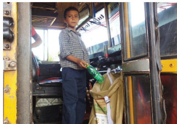
Campaign to raise awareness of garbage management in the Northern Caribbean Coast Autonomous Region.

In conjunction with the United Nations Development Program (UNDP) in the Segovias region, Partners for Resilience trained local journalists on subjects related to disaster risk reduction, climate change adaptation and ecosystem management and restoration.