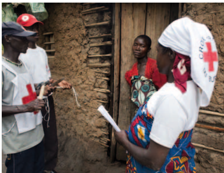
Burundi Red Cross volunteers carry out door-to-door visits to check that mosquito nets are being used properly.

It is more difficult to measure the social value of volunteers, but governments should be aware that people working side by side and delivering services to the vulnerable create a sense of community empowerment and solidarity that money cannot buy. As a recent Red Cross pilot project in Burundi shows, volunteerism can help a post-conflict, ethnically fractured society rebuild and recover. In 2010, Burundi Red Cross volunteers built 8,115 houses for refugees returning from Rwanda and Tanzania – people they considered to be in particular need. With no external funding, they built the homes with materials available in their community. It is just one example of the widespread and ongoing collaboration between Hutus and Tutsis since the ethnic violence of the 1990s. One volunteer said: "Now we're working together to help vulnerable people, and, knowing each other, we will not return to civil war."