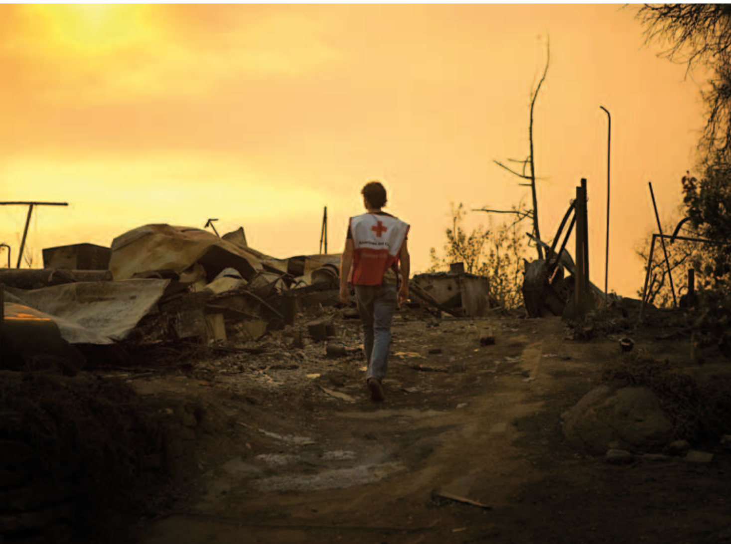
An American Red Cross volunteer surveys the destruction caused by the Harris fire, which affected approximately 75,000 acres in south-eastern San Diego County.

whilst waiting for responders. Since the United States Federal Emergency Management Agency (FEMA) made the programme nationally available in 1993, CERT has conducted training in 28 states and in Puerto Rico. In several emergencies, CERT volunteer teams have partnered with local Red Cross branches, often arriving before the Red Cross and helping to share the workload.