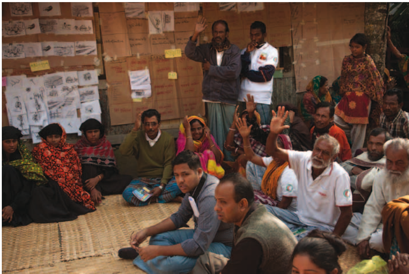
Volunteers from the Bangladesh Red Crescent Society are providing communities with tools for improving their living environments, offering a step-by-step method for building safer housing.

Volunteers also play a crucial role in preventing emergencies, particularly outbreaks of disease. Mongolia is a vast, sparsely populated country where 2.7 million people occupy 1.5 million square kilometres of land, and where some 38 per cent of the population is nomadic. It lies on a major migratory route for wild birds, which makes it vulnerable during outbreaks of avian influenza. In 2006, the Mongolian Red Cross Society developed an avian influenza programme, using its network of local volunteers to cover nearly all the country's territory. Within two years, 800 trained volunteers raised the awareness of more than 350,000 people, and in 2008 there wasn't a single human case of H5N1 in Mongolia.