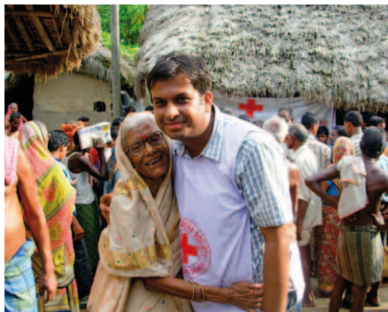
A flood survivor in Odisha gives a warm welcome to an Indian Red Cross volunteer.