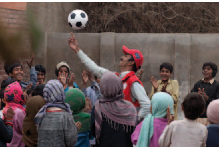
A psychosocial support project in Sindh province, run by the Danish Red Cross and the Pakistan Red Crescent Society, helps children recover from the trauma of the floods.