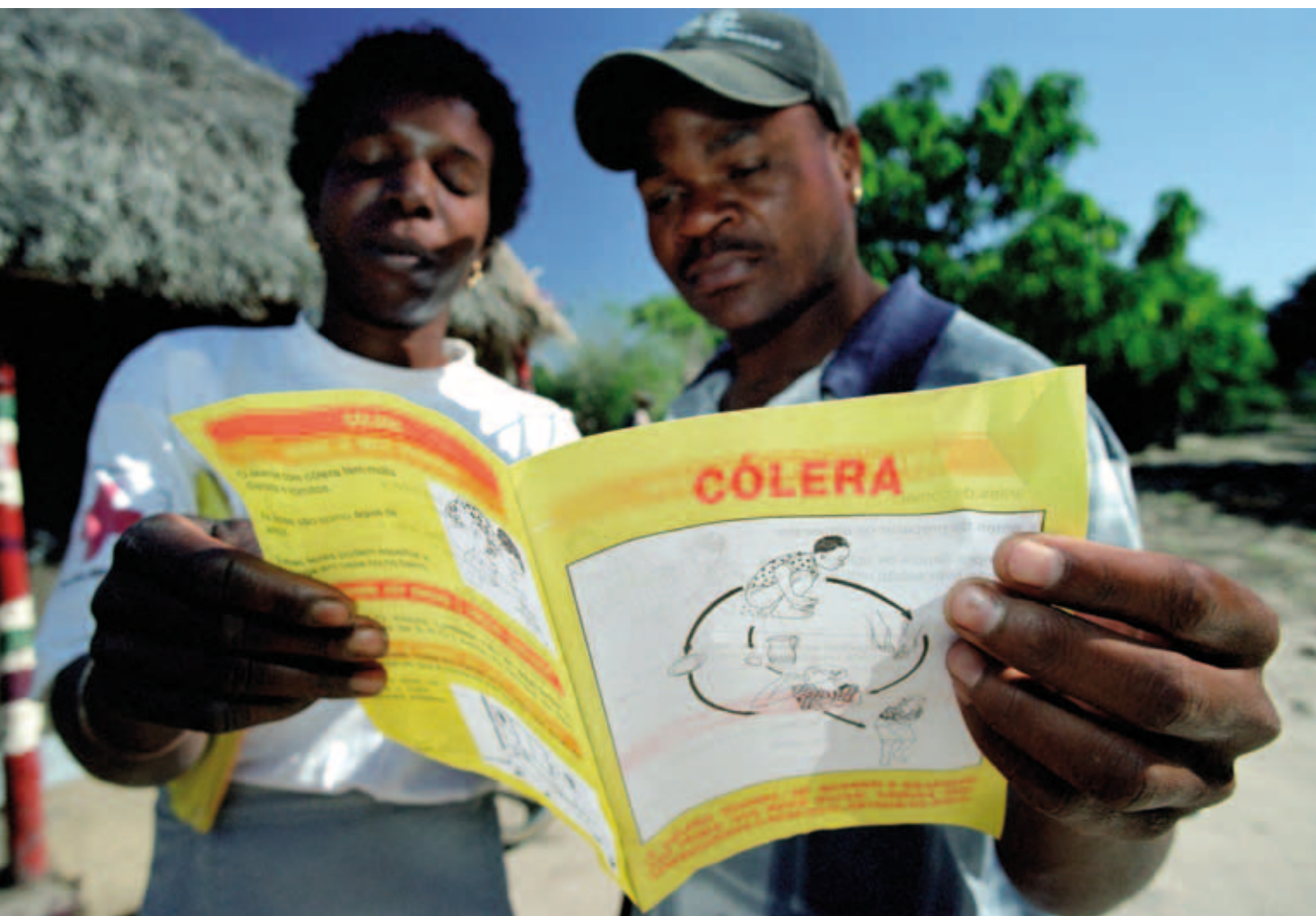
A volunteer with the Mozambique Red Cross Society explains about cholera prevention in 2010.