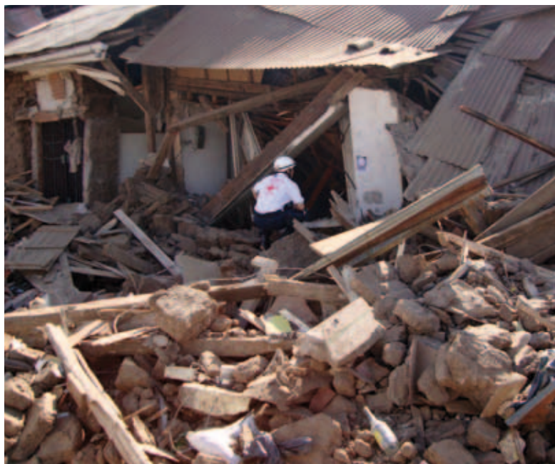
Following the devastating earthquake on 28 February 2010, Chilean Red Cross volunteers carried out emergency response activities such as search and rescue, evacuating patients, removing debris and recovering bodies.

or capacity. What is certain is that in 186 countries, Red Cross and Red Crescent volunteers are consistently at the front line of emergencies, from tsunamis to civil wars to pandemics.