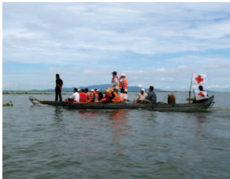
A Cambodian Red Cross Society disaster response team visits the flooded commune of Cork Trabek in Kampong Thom province in 2011.