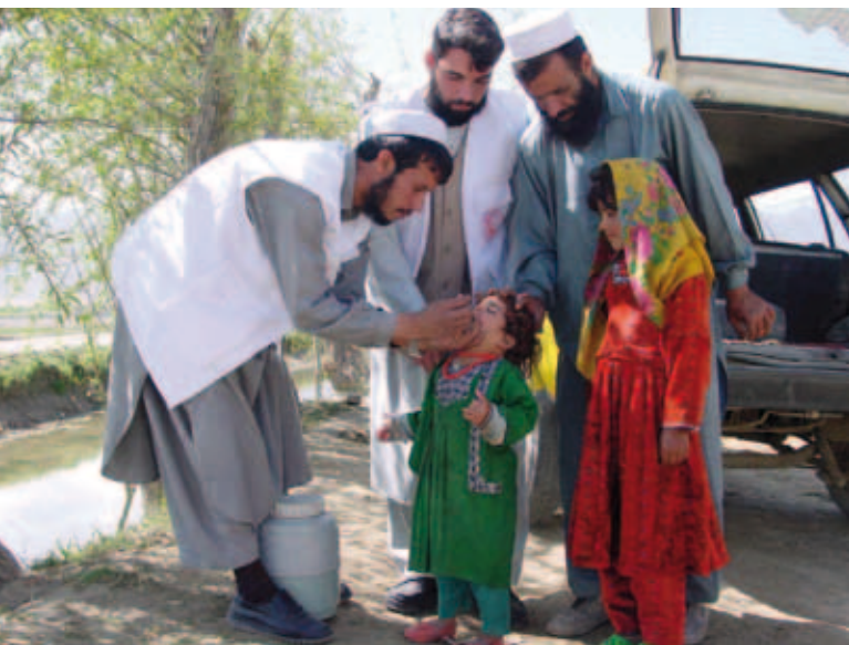
Afghan Red Crescent Society volunteers carry out polio vaccinations during a national immunization campaign.

Awareness campaigns and the dissemination of the Fundamental Principles of the International Red Cross and Red Crescent Movement in schools, military and police compounds help build a culture of recognition and respect for volunteers. It goes without saying that in times of conflict, no party should ever target the Red Cross or Red Crescent – or indeed any other humanitarian organization – nor misuse the emblems, equipment or volunteers for their own means.