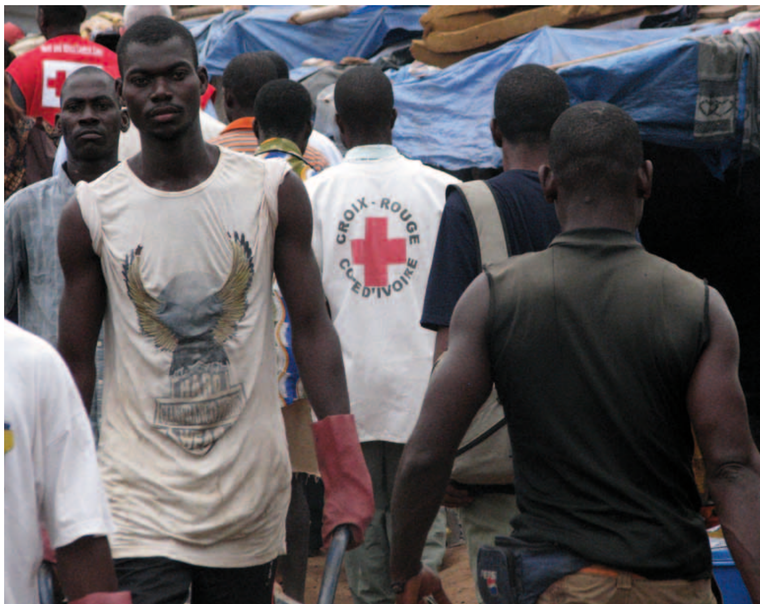
Red Cross Volunteers walk through a camp for displaced people in Duékoué, western Côte d'Ivoire, where thousands of people fled after violence broke out following the December 2010 elections.

although the IFRC has recently released a report on the legal framework applicable to volunteering in emergencies, which is based on desk research and country studies. The report says countries fall into roughly four categories. In some instances, legislation is clear with regard to the definition of a volunteer and volunteers' activities. In other jurisdictions, there is an absence of clear definitions or scope of volunteering activities, which creates grey areas in the law. In yet other cases, there are barriers or legal provisions in various sectors – for example, labour laws or tax laws – that may prohibit or restrict volunteering. Still others have laws on disaster management or emergency response that make particular reference to volunteers. Generally,