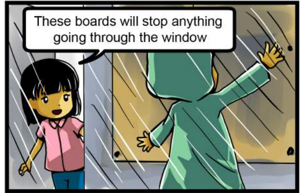
These boards will stop anything going through the window