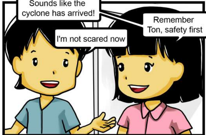
Sounds like the cyclone has arrived!