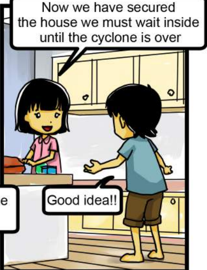
Now we have secured the house we must wait inside until the cyclone is over