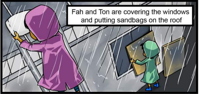
Fah and Ton are covering the windows and putting sandbags on the roof