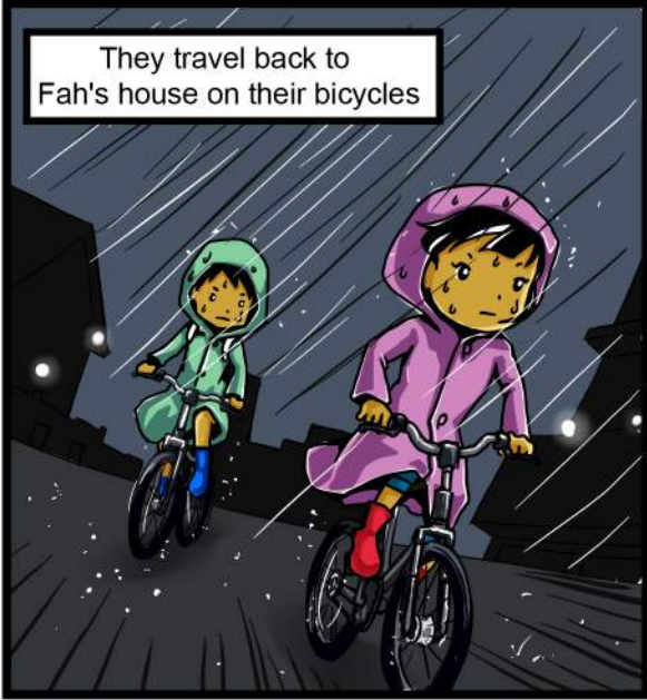
They travel back to Fah's house on their bicycles