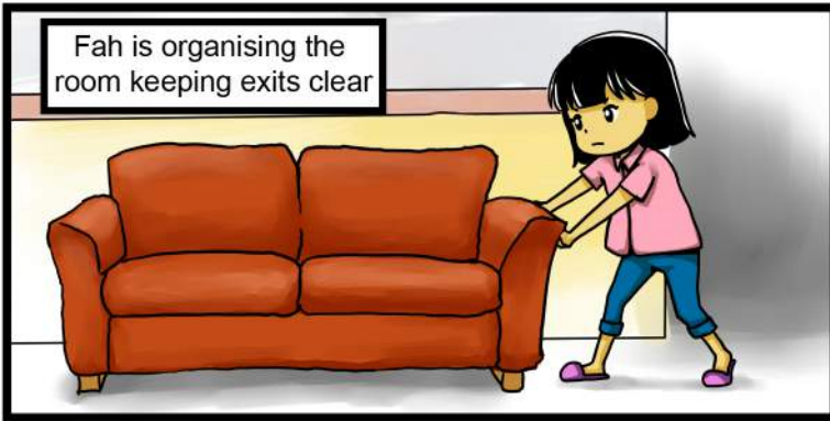
Fah is organising the room keeping exits clear