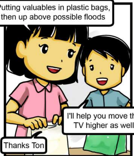
Putting valuables in plastic bags, then up above possible floods