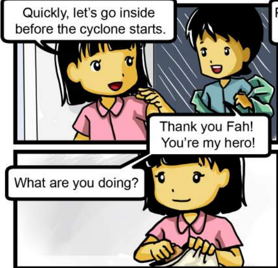
Quickly, let's go inside before the cyclone starts.