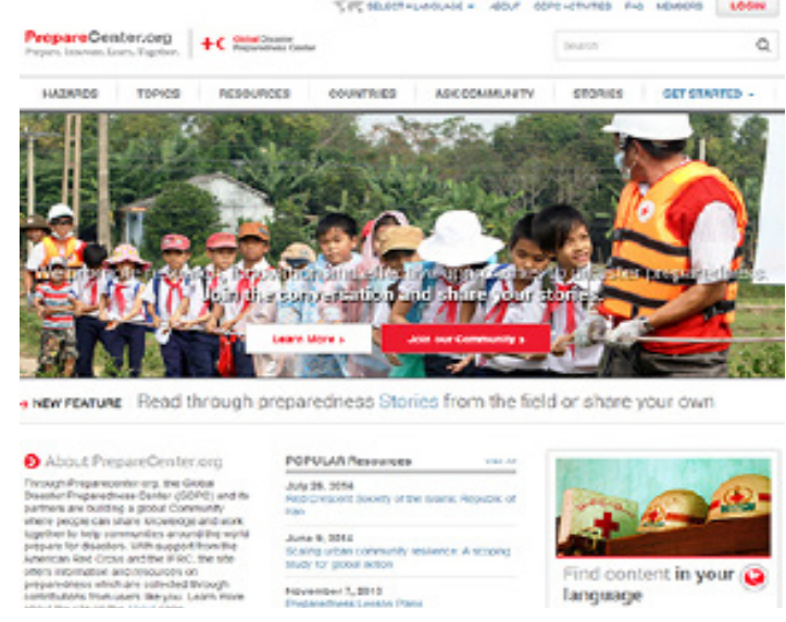
Preparecenter.org is a virtual community of practice where disaster practitioners can share knowledge, resources and experiences on disaster preparedness and related issues.

The GDPC website, PrepareCenter.org , serves as an interactive repository and exchange for tools, evidence and advice on disaster preparedness for practitioners, governments, individuals and families, non-governmental organizations and private-sector businesses. Collaboration on the site takes place through multiple languages and engages a large number of participants in contributing, adapting and improving tools and other disaster preparedness resources. As the virtual network grows, the GDPC will further develop the site with new tools and features, based on user feedback and technology innovations.