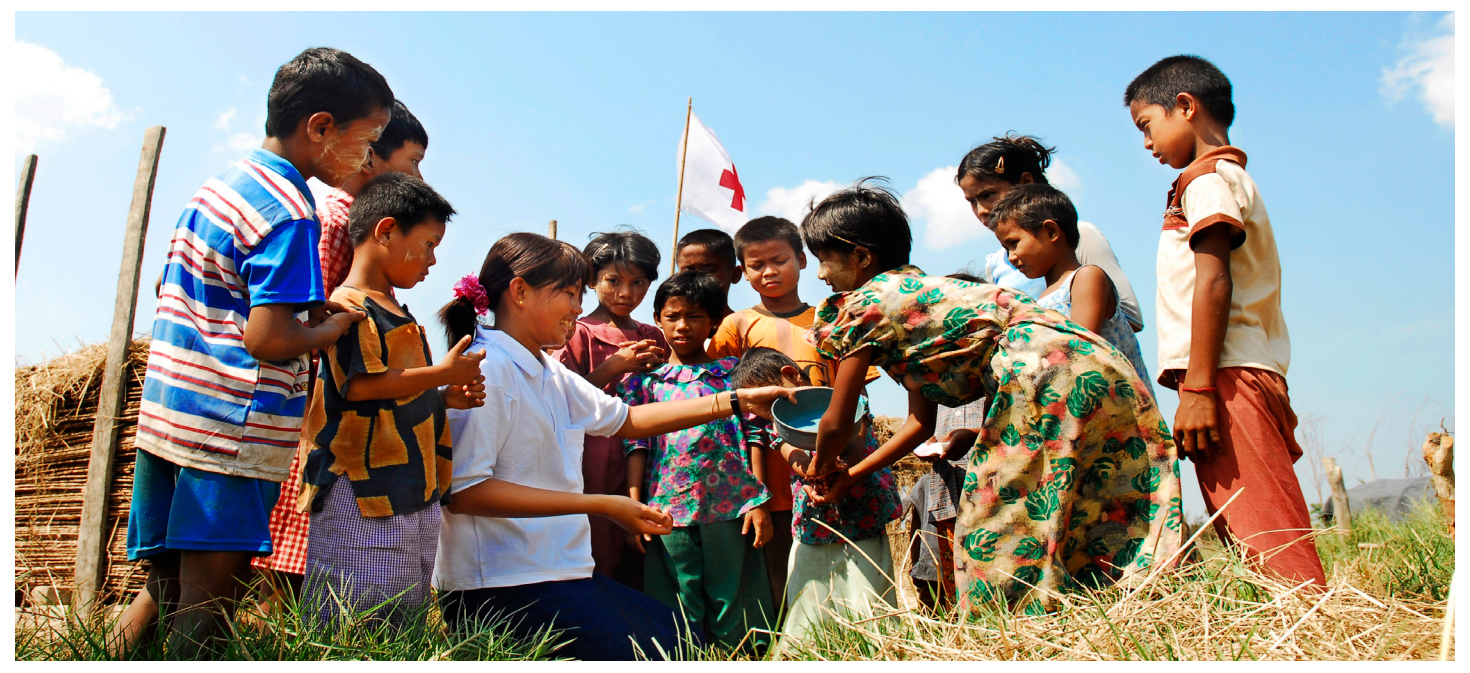
Myanmar Red Cross volunteer and her team distributes food and relief items after Nagris cyclone.