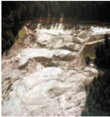
Fatal failure of tailings dams at Stava, Italy