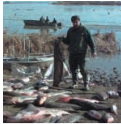
Fish killed by cyanide spill at Baia Mare, Romania