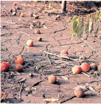
Orchard swamped by tailings, Aznalcóllar, Spain

Guidance for the Mining Industry in Raising Awareness and Preparedness for Emergencies at Local Level