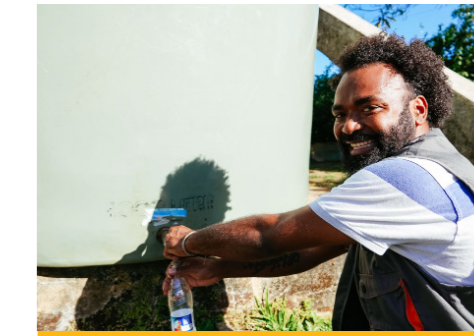
"The water supply was identified in the city-wide assessment — it hasn't been upgraded since World War II." Community member, Mango, Luganville, Vanuatu.