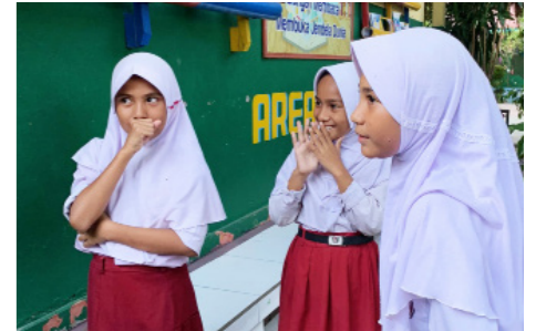
These students won the schools' hand-washing competition to help raise awareness about good hygiene practices. One of the key challenges of the coalition was creating behavioral change amongst citizens. Ternate, Indonesia.