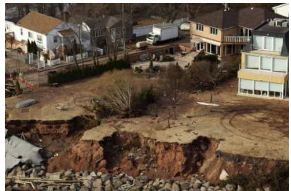
Figure 2: View of coastal erosion on Coney Island, New York iv

An example of the ecological impact of coastal erosion in South Asia can be seen in the city of Cox's Bazar, Bay of Bengal, in Bangladesh. The rising sea level caused coastal erosion in the area, severely impacting the mangrove forests, marine biodiversity, and bird species and the area's tourism v . In Cemarajaya, situated 100 km north of Jakarta on the West Java coastline, Indonesia, over the past 16 years, coastal erosion has displaced over 300 households vi . Since 2016, the shoreline has receded by 2 km, resulting in the ocean encroaching upon thousands of hectares of land. As a consequence, one entire hamlet is now submerged underwater. The city of Dakar, Senegal, located on the West African, provides an example of coastal erosion. Due to heavy sand mining and rising sea levels between 1954 and 2018, the country's coastline retreated by an average of 3 meters per year. This coastal retreat has destroyed several houses, tourist buildings, agricultural land and fishing infrastructures and led to beaches disappearing vii .