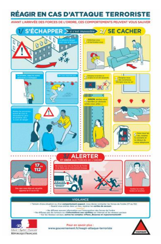
Figure 1 - Poster by the French Government on how to respond to a terrorist attack<sup>1</sup>

published a poster (Figure 1) informing the public what to do in response to a terrorist attack. Furthermore, in the UK in December 2015, the National Police Chiefs' Council released a video informing the public of how to respond to a firearms or weapons attack (Krol, 2015). Thus, the attacks may act as an impetus for countries across Europe to review how they communicate with their public about preparedness for terrorism.