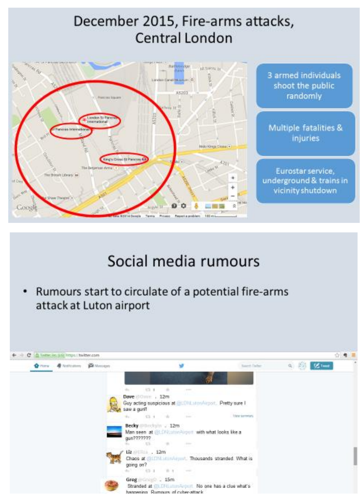
Figure 2 - Scenario slides from workshop 2

In order to encourage participants to consider community preparedness for large-scale and crossborder terrorist attacks with cascading effects, a series of questions were asked following the scenario presentation. The questions and participant responses are highlighted in Table 3.