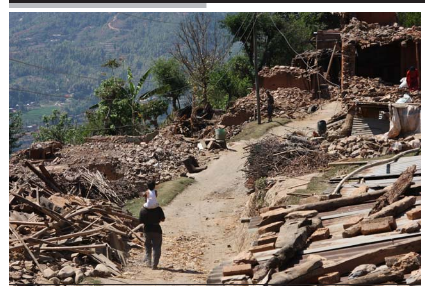
Nepal Earthquake Affected Village in Karve District.

services for Disaster Risk Reduction and also provide food, safe water and medicine etc.