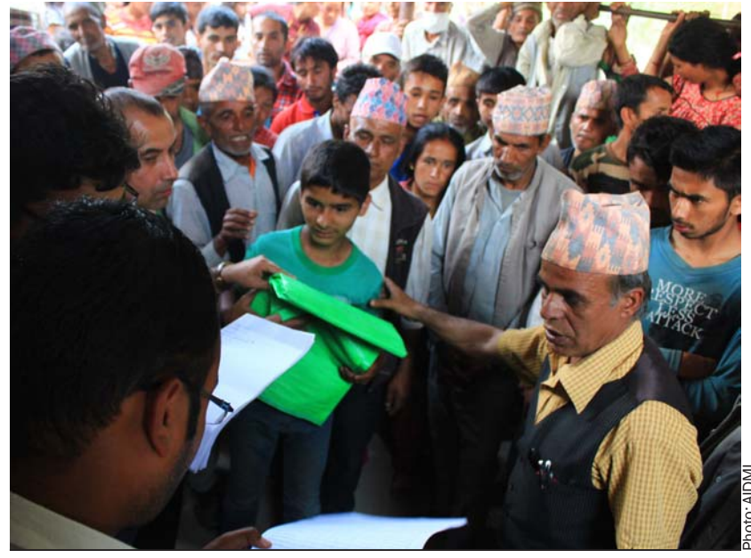
Relief distribution at Sudal village.

Resources were mobilized and the relief materials were procured from India and got delivered to