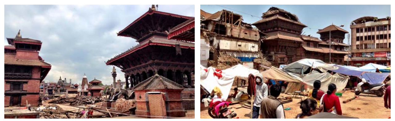
"The powerful earthquake that hit Nepal on 25 April 2015 is a painful reminder of the region's vulnerability to devastating disasters. Lessons from this tragedy will be used through the World Humanitarian Summit South and Central Asia regional consultation to improve future humanitarian action."

The global humanitarian aid system is undergoing close scrutiny to seek ways to improve on its delivery to people affected by conflict and disasters. Listening to the actors, traditional and nontraditional is part of the process that will culminate in the World Humanitarian Summit (WHS) in Istanbul in 2016. Tajikistan is preparing to host the South and Central Asia World Humanitarian Summit regional consultation which takes place at the end of July 2015.