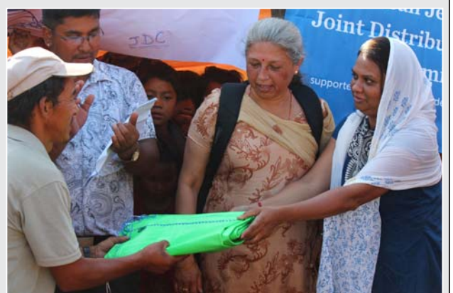
Unloading & sorting of material at Fisling before distribution. Distribution in Bhumli Chowk VDC.