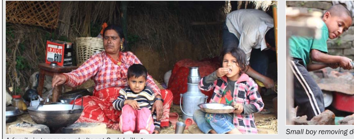
A family in temporary shelter at Sudal village.