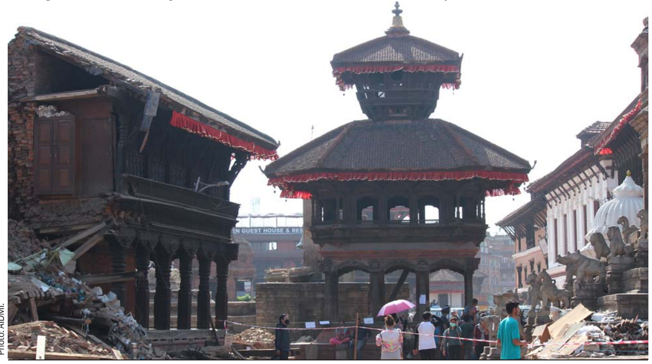
Damaged heritage site at Bhaktapur Darbar square .

1 Langenbach R., 2010, 'Earthquake Resistant Traditional Construction' is Not an Oxymoron'