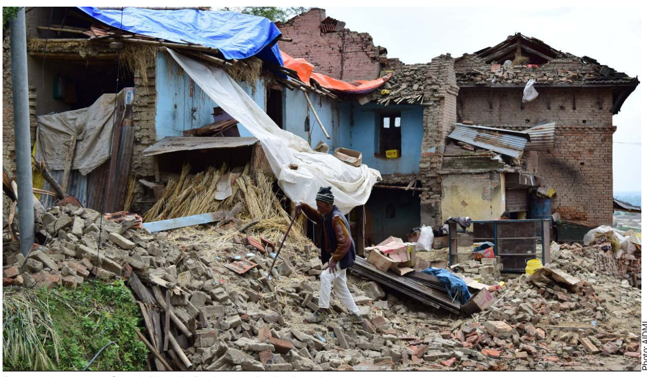
Damaged houses at Sudal village in Bhaktapur district, Nepal.

1 UNHCR 2015, Sources: OCHA, UNDAC, UNRCO (Nepal), Government of Nepal, MapboxNepal:2015 Earthquakes