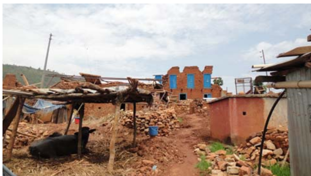
The outer layer of stones are thrown off.

The fast construction without any line and level, no breaking of vertical joints, no ties, the erratic filling in of the inner core with small pieces of stone and mud mortar packing, disregarding the small voids, with concentration only on the line of the