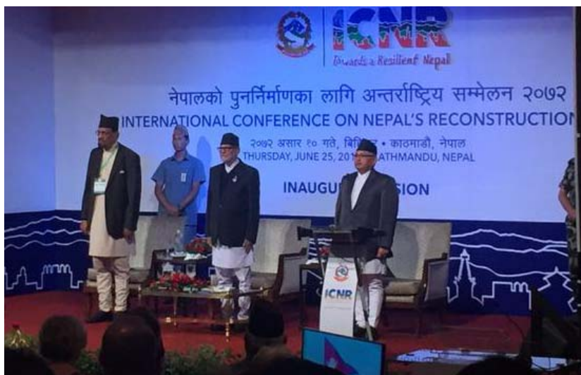
The donor conference held on 25th June, 2015.

The donors have expressed their priorities mainly on restoring public facilities, heritage sites and infrastructure development such as roads and bridges. Likewise, there have been pledges of support for economic reconstruction and skill training to the youths for reconstruction.