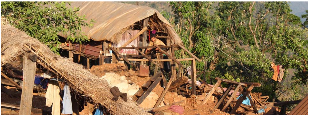
Kyarakth village