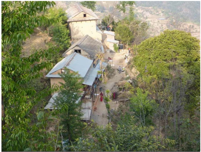
Traditional housing in a mountain village near Dhulikhel, Nepal.

The Gorkha Earthquake caused many of Nepal's traditional masonry, mud and timber buildings to collapse. But many others survived, and these can be used to teach valuable lessons for rebuilding. Investigation of the damage by expert members of UNESCO's International Council on Monuments and Sites-International Scientific Committee on Risk Preparedness (ICOMOS-ICORP) has highlighted the value of traditional earthquake resistant construction technologies incorporated into the surviving buildings. Key elements, which include the use of timber ring beams and large stones to brace building corners and bond walls together, are consistent with Nepal's