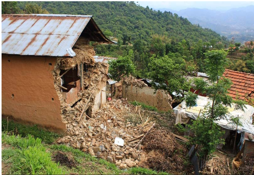
A house with collapsed shorter length wall in Sudal VDC.

Nepal has witnessed its worst disaster after a gap of 80-85 years. Last time there was an equally devastating one in 1934. The extent of damage during 1934 earthquake still exists as a fade memory in minds of elders who were kids at that time. An earthquake of Magnitude 7.8 is well capable of creating massive destruction, which it did all across the beautiful hilly nation. It took relief efforts of many days after the earthquake to reach upto remote villages, leave aside the assessment of damage. When the picture started