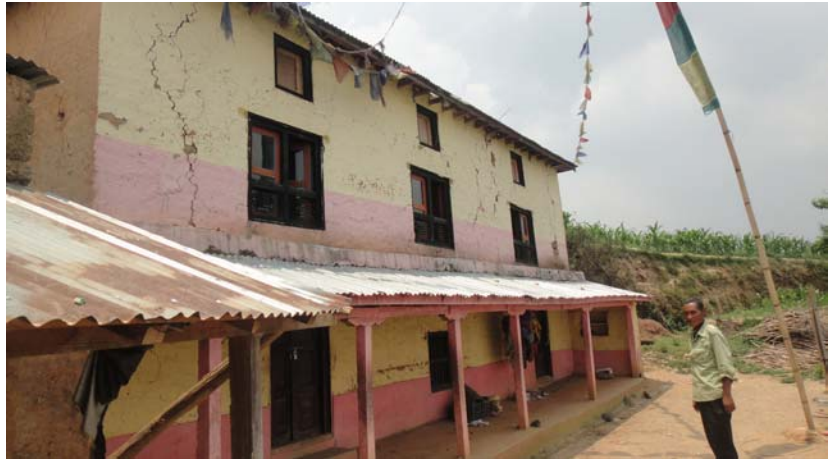
A seemingly safe house in Dhadagaun, Kavre, where the walls have all cracked: stone walls in mud mortar (local earth is more of sand content).

25th April, 2015 a day of dread and remorse for those that have risen and survived the worst of nature's tantrums. As the clouds of dust settled and smoke from the innumerable piers reached out to the sky and beyond, realization hit that the fatalities increased, due to the blunders of all concerned. The beautiful settlements and village clusters and our beloved heritage sites, we overlooked the requirement to strengthen our habitats, temples and palaces, to withhold the rattling and shaking of Mother Nature at its worst.