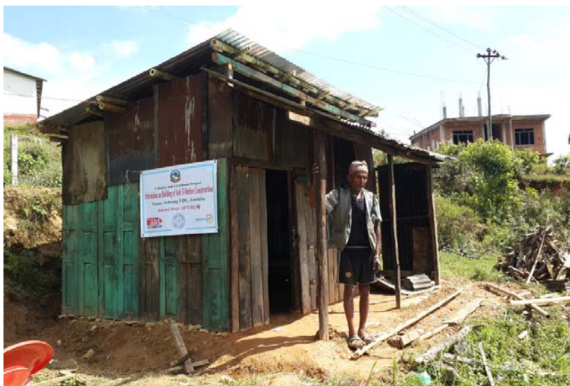
Practical Action supporting temporary shelters for monsoon.