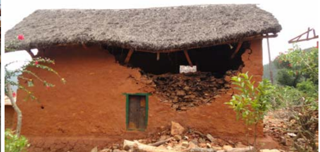
Reduced to rubble...a once thriving village of the Hayu's (pallaquin bearers)