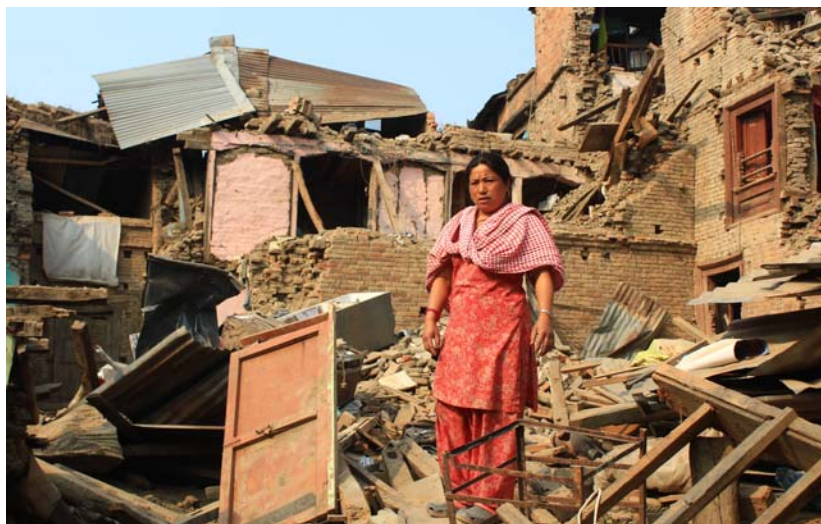
A women stands to her damaged house in Sankhu.

The SFDRR was adopted by 187 member states at the 3rd UN World Conference for Disaster Risk Reduction (WCDRR) in March 2015 in Sendai, Japan. It aims at the substantial reduction of disaster risk and losses in lives, livelihoods and health and in the economic, physical, social, cultural and environmental assets of persons, businesses, communities and countries. The Framework makes a major shift from disaster management to disaster risk management as well as prevention of existing and new risks as imperative to development for resilience and sustainability. It also