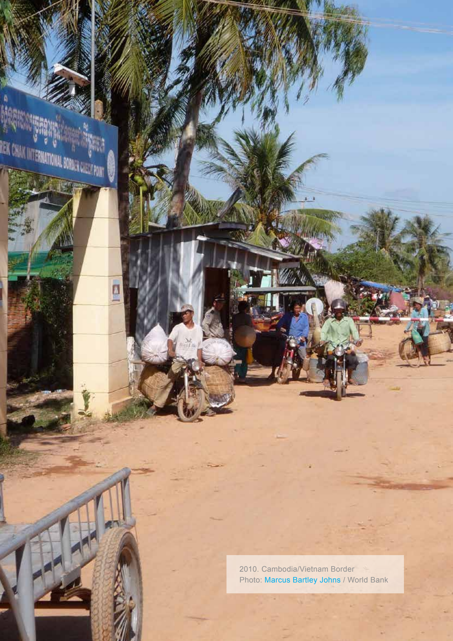
2010. Cambodia/Vietnam Border