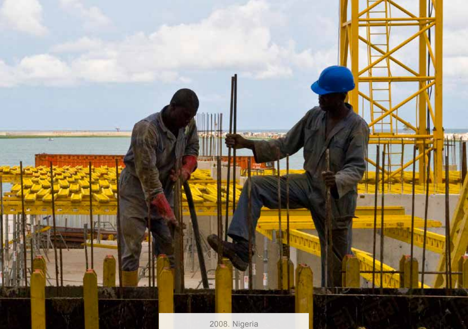
2008. Nigeria