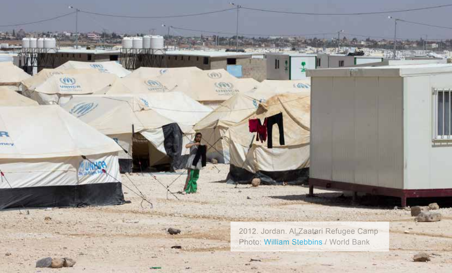
2012. Jordan. Al Zaatari Refugee Camp

The WCO Convention on Temporary Admission 1990 is yet another important instrument which facilitate disaster assistance by way of import and duty and tax exemption for humanitarian goods. However, the Convention is limited to items intended for re-exportation, and does not include those goods brought in by relief personnel which are critical for humanitarian operations but not provided as aid to disaster victims, such as ICT equipment. In 2014, the IFRC, OCHA and WCO submitted an information paper to the administrative committee of the Convention to shed light on these deficiencies, including the fact that the majority of goods and equipment imported for humanitarian purposes are not re-exported, but distributed as aid, or donated to local authorities and other actors. 9 The