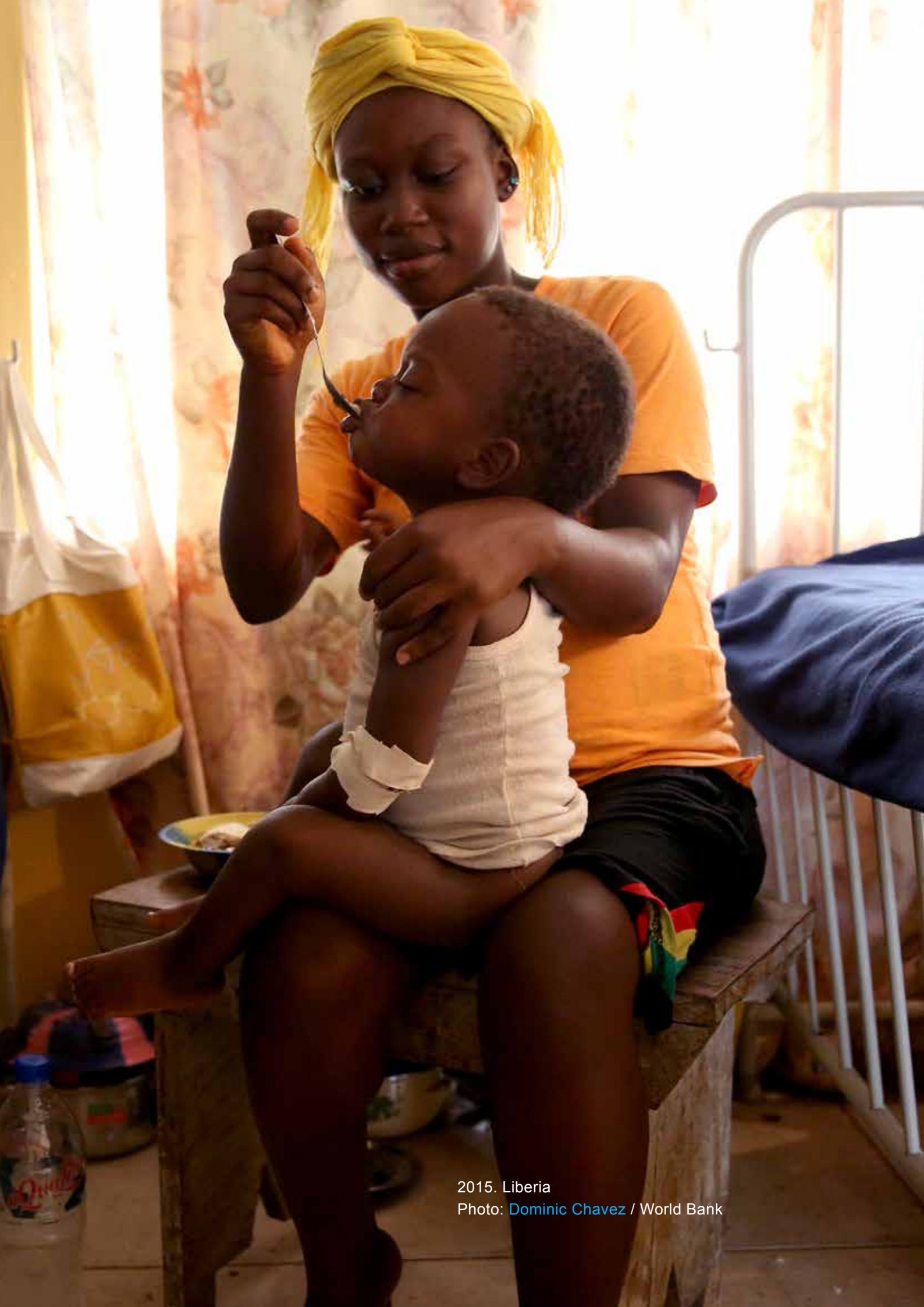
2015. Liberia