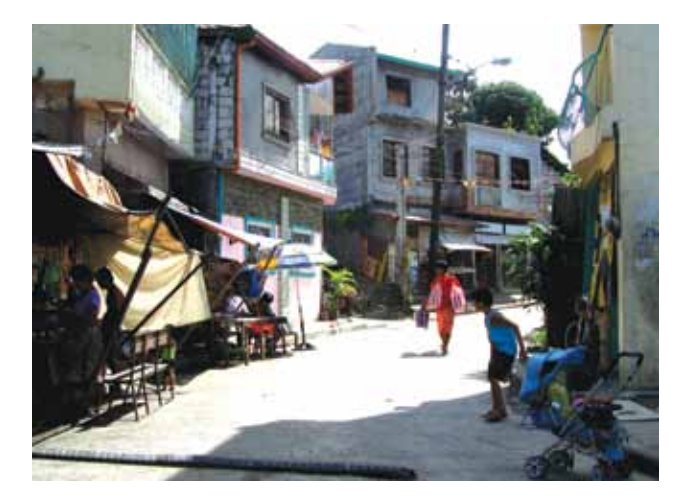
Families in Golden Shower community, a CMP site, have been able to improve their houses. Roads have also been developed by the local government.

Finally, in July 2009, GSHAI-II's CMP loan was released. Monthly amortizations ranged from PHP 252 to PHP 411 per month, which residents thought very affordable. In the first months, GSHAI-II had a collection rate of almost 100 per cent, with some families wanting to pay their loans in full.