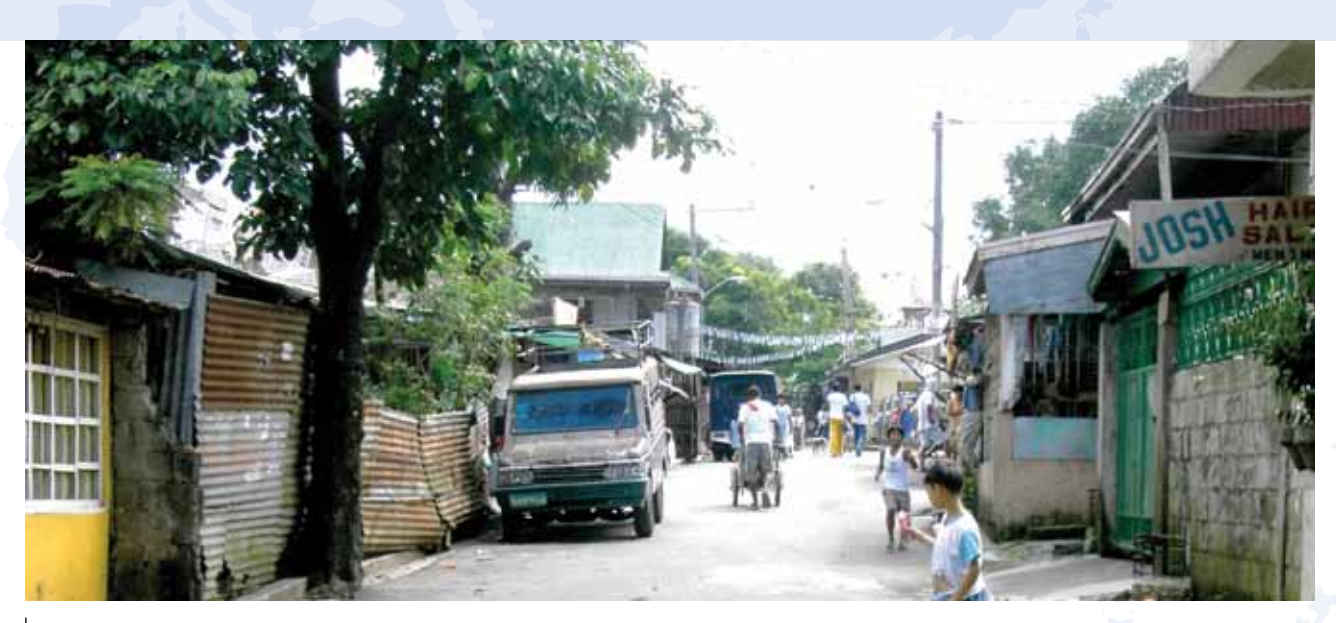
Urban poor communities enjoy the benefits of the new road system and other infrastructure after a land proclamation in Quezon City.