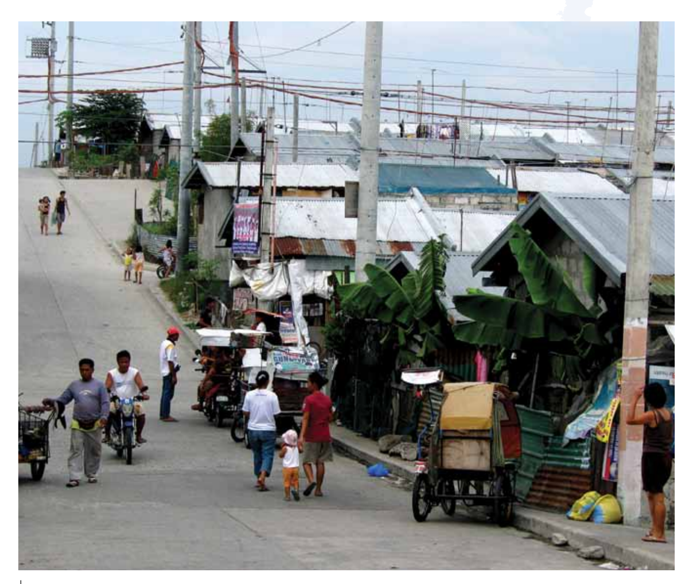
For the beneficiaries, Southville 3 provided them decent and affordable shelters.

property as a resettlement site for approximately 7,000 informal settlers in the city, most of whom were to be displaced by the South Rail project. The landowner was the Republic of the Philippines and the usufructuaries were the informal settlers relocated to the NHA-built housing in the resettlement site.