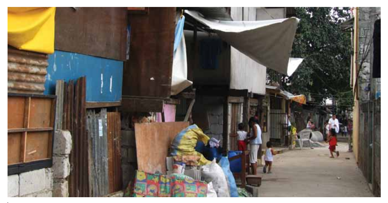
Communities in NGC have to follow the approved subdivision plan by adjusting their houses to make way for access roads.

In 2009, about 4.5 hectares in the West Side, with approximately 650 families, was still unacquired. In the East Side, 129 hectares underwent judicial reconstitution because there were no existing titles to establish ownership. Reconstitution was expected to take some time.