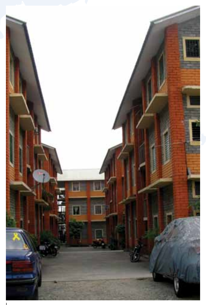
FTI-Taguig MRB is the latest socialized housing venture of HFHP.

The project yielded 96 housing units with a floor area of 26.10 square meters each, dispersed across eight buildings. The tenure arrangements were similar to those for Pinagsama and Bagumbayan, but buyer's financing would be sourced from the Pag-IBIG Fund.<sup>19</sup> After taking out a Pag-IBIG loan, a Contract to Sell was issued to the beneficiaries. Monthly amortization on the unit was PHP 950, payable over 25 years. City employees, teachers, Philippine National Police staff, military personnel and other qualified informal settlers formerly residing in the FTI Compound were the target beneficiaries.