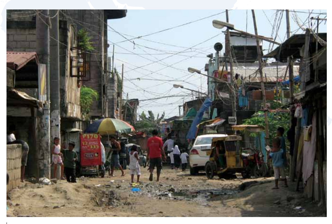
Slum condition in Baseco slum settlement, Manila.

renewal area". This implied that the informal settler families living within the 10 metre prescribed legal easement of the river would have to be relocated to government-established sites outside Metro Manila. But the families faced with eviction sought the help of an NGO and lobbied with the Office of the President and the HUDCC for the site to be "proclaimed".