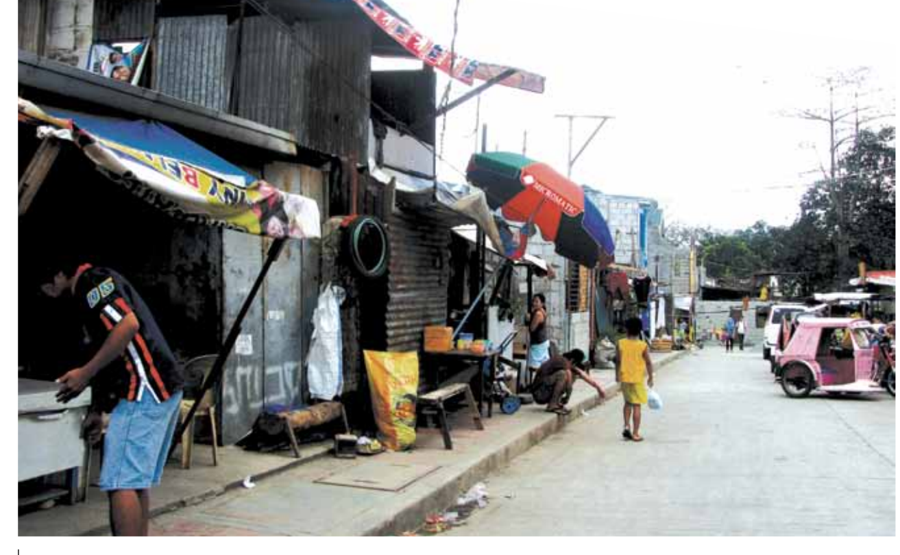
Unlike in Baseco settlement, roads in NGC are more developed.

Residents of the Baseco-proclaimed site feel more secure now that they did before the area was proclaimed because they expect to be given land titles in the future even with the unresolved issues about the suitability of some areas for residential structures. In the NGC, people currently feel a greater sense of security compared to the residents of Baseco, because of the distribution of lot awards. Many areas are being re-blocked, which the residents view as stronger evidence of security because it signals the Government's resolve to transfer ownership of the home plots to them.