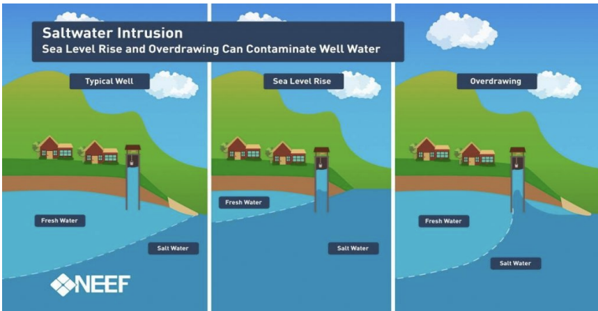
Figure 2: Different scenarios of saltwater intrusion in freshwater level, Source