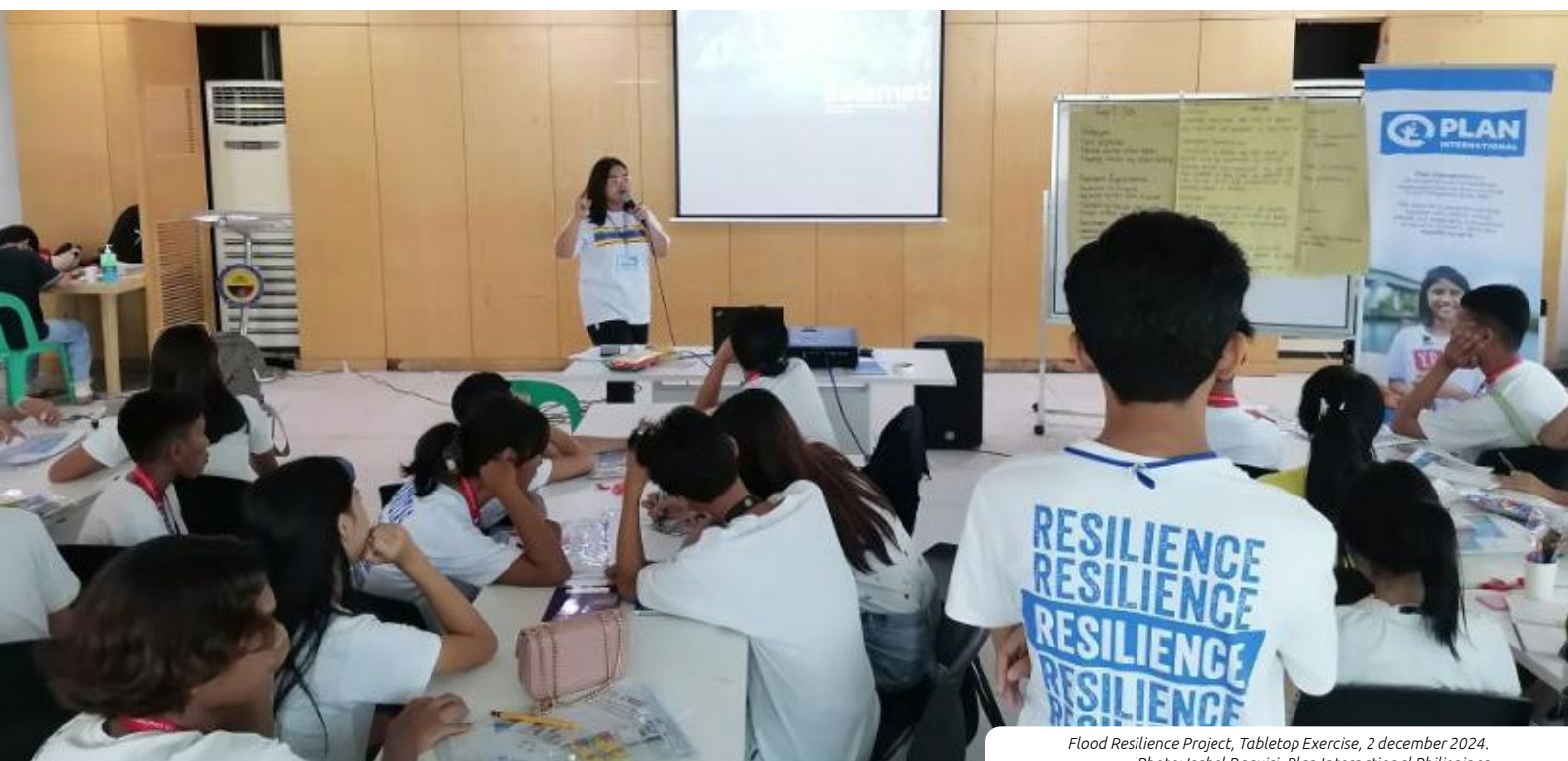
Flood Resilience Project, Tabletop Exercise, 2 december 2024.

Over the 12-year period of the Alliance, the Philippine Red Cross (PRC) will target urban areas affected by flash flooding, riverine flooding, heatwaves, and typhoons in Metro Manila and beyond. Between 2024 and 2027, the programme will collaborate directly with local communities in the Province of Rizal, the City of Marikina, Quezon City, the City of Cebu, and the Municipality of Alegria in Cebu to increase climate resilience.