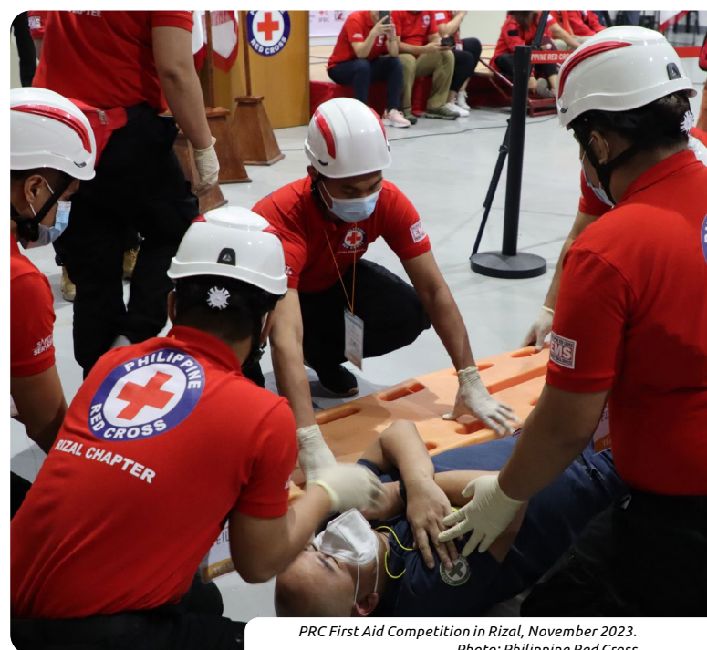
PRC First Aid Competition in Rizal, November 2023.

humanitarian field. Driven by a mandate to alleviate human suffering and uplift the dignity of the most vulnerable populations, the PRC is active across a network of 102 local chapters across the country. The PRC is supported by the International Federation of Red Cross and Red Crescent Societies, the world's largest humanitarian network, reaching 150 million people in 191 countries.