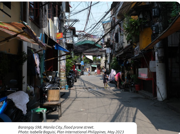
Barangay 598, Manila City, flood prone street. Photo: Isabelle Baguisi, Plan International Philippines, May 2023